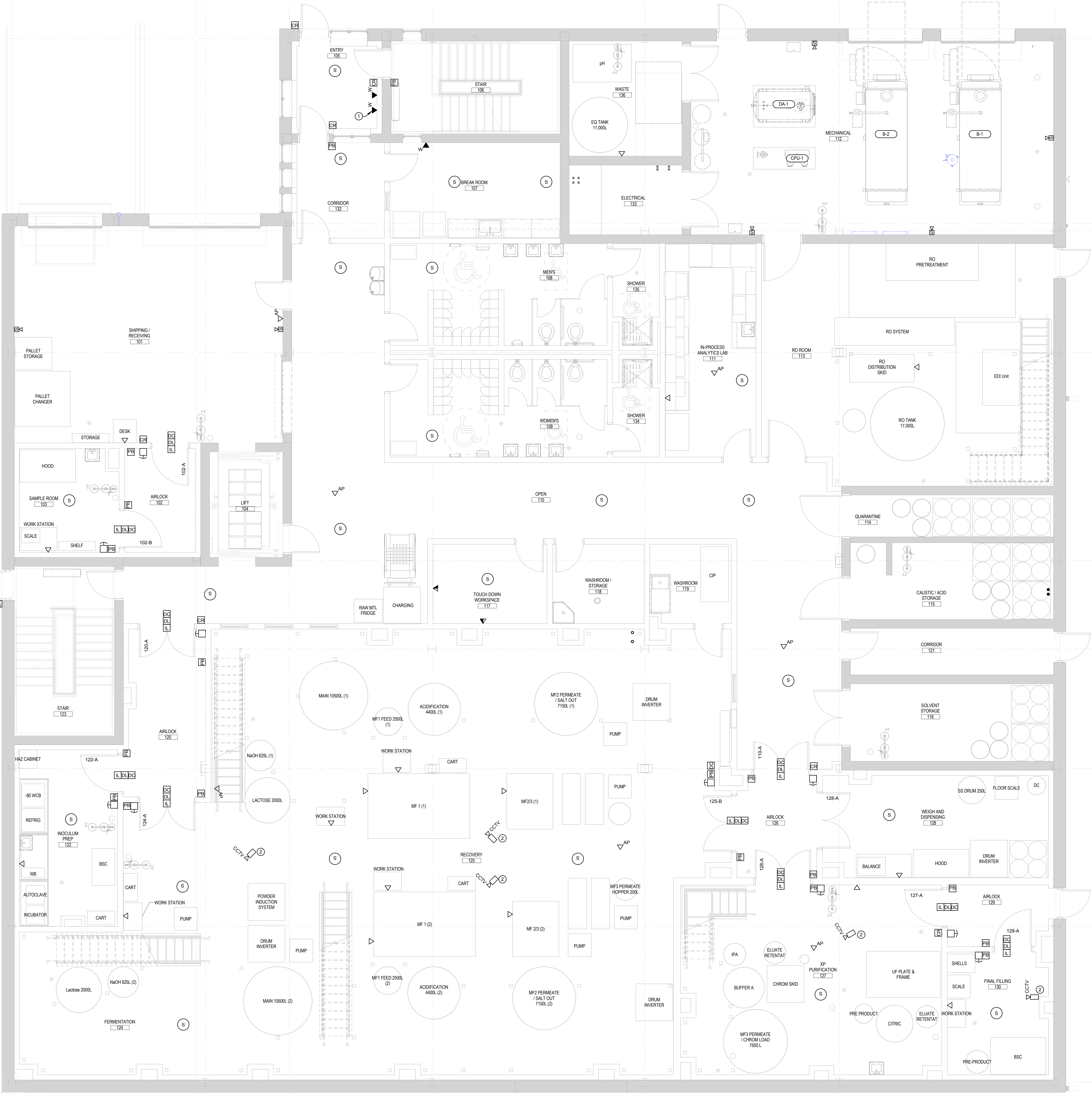
1 FIRST FLOOR - TELECOMMUNICATIONS & SECURITY PLAN 1/4" = 1'-0"