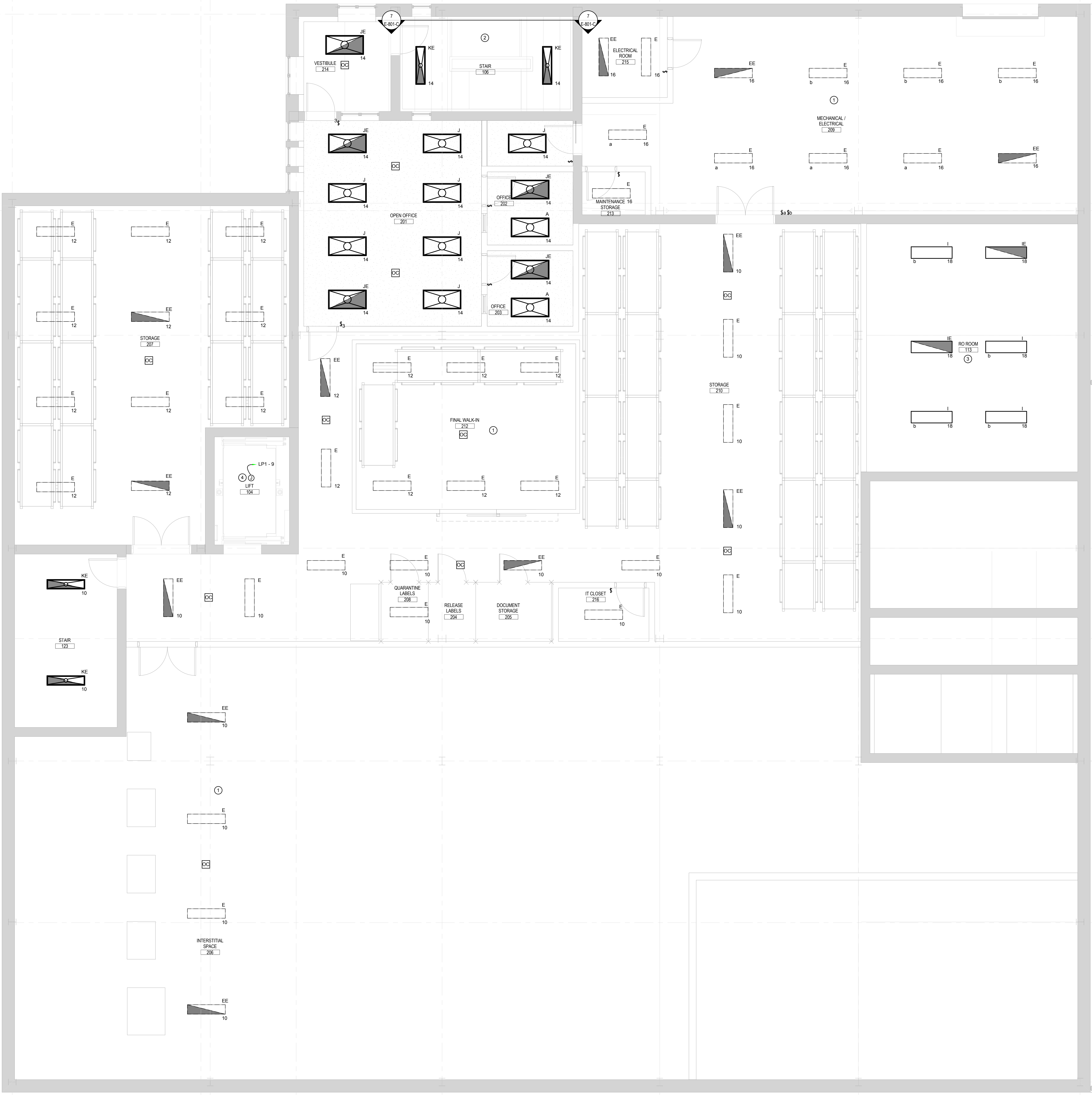
1 SECOND FLOOR - LIGHTING PLAN 1/4" = 1'-0"

ORIGINAL SHEET: A06.E (04.14) DATE: 08/19/2016 PROJECT: 191504176