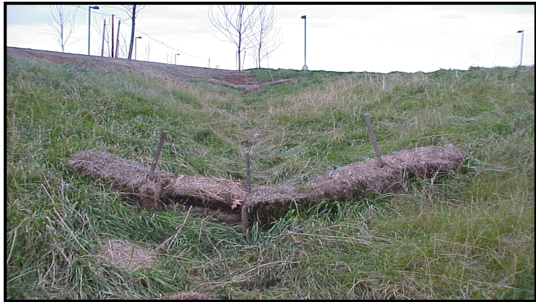
VEGETATED SWALE WITH HAY BALE CHECK DAM TO REDUCE VELOCITIES UNDER CONSTRUCTION

Applicability: The Riverside Street facility will have minor open channel systems as shown on the drainage and stormwater management plans.