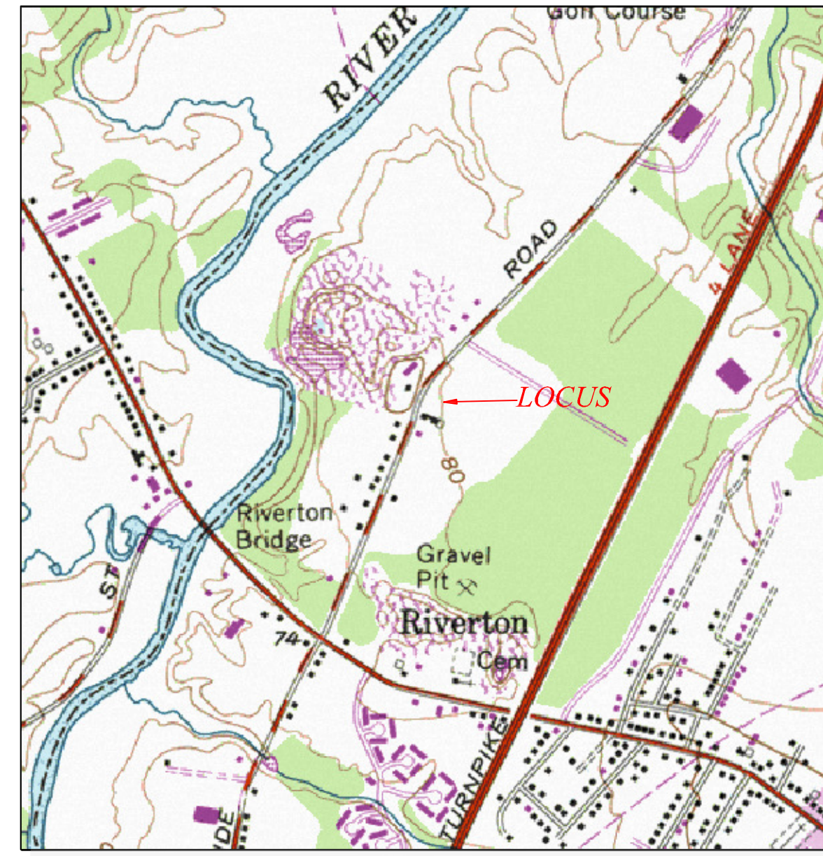
LOCUS MAP PORTLAND WEST USGS QUAD SHEET SCALE 1"=1000'

PLAN REF. 1, LOT 13 MICUCCI BROTHERS BOOK 12711-PAGE 4 CBL 329 B007001