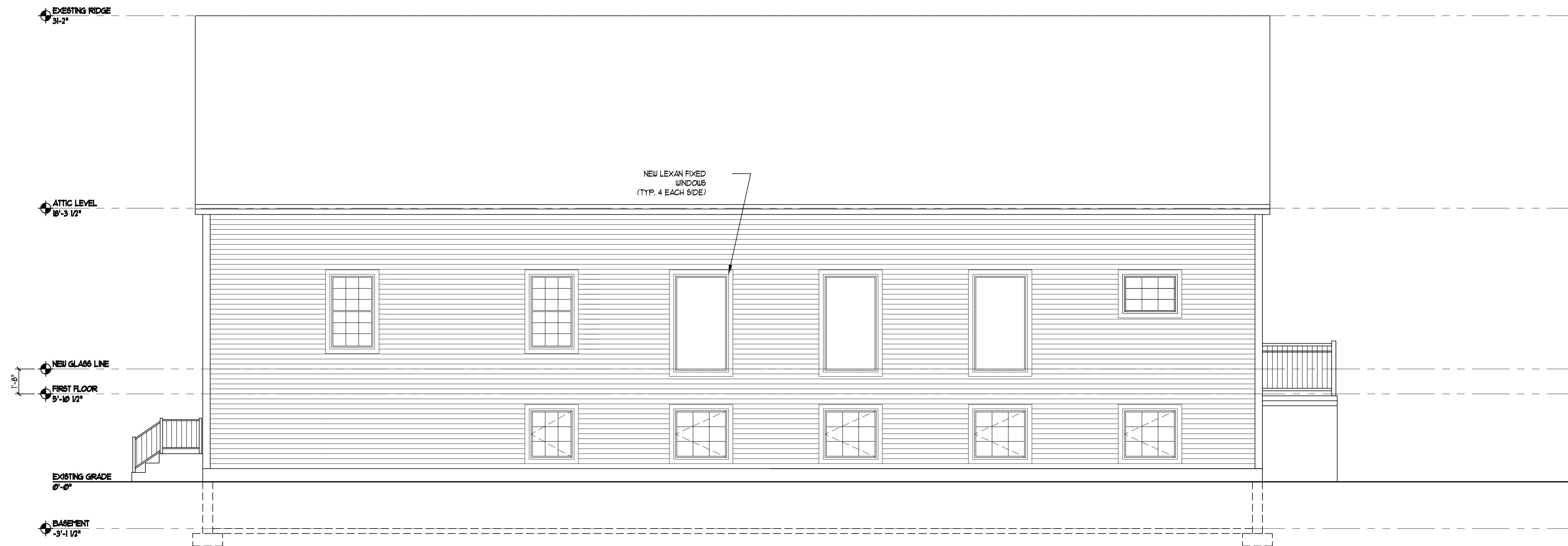
2 EAST ELEVATION A3 SCALE: 1/4" = 1'-0"

NOTE: THIS DRAWING IS PROVIDED FOR INFORMATIONAL PURPOSES ONLY. IF USED FOR CONSTRUCTION, THE CONTRACTOR ASSUMES ALL RESPONSIBILITY FOR LOCAL CODE COMPLIANCE. ALL DRAWINGS, PLANS, SKETCHES, ETC. ARE PROVIDED TO OUR CLIENTS BASED UPON INFORMATION PROVIDED BY THE CLIENT AND DRAIN IN ACCORDANCE WITH COMMON BUILDING PRACTICES AND LOCAL CODES. NONE OF THE EMPLOYEES OF FMC CADD DRAFTING SERVICES, INC. ARE REGISTERED ARCHITECTS, ENGINEERS OR LAND SURVEYORS. ALL DIMENSIONS AND SPECIFICATIONS SHOULD BE VERIFIED BY CLIENT AND/OR CONTRACTOR BEFORE ACTUAL CONSTRUCTION BEGINS. IF DIMENSIONS AND SPECIFICATIONS ARE NOT VERIFIED BY CLIENT AND/OR CONTRACTOR BEFORE ACTUAL CONSTRUCTION BEGINS FMC CADD DRAFTING SERVICES, INC. WILL BE HELD HARMLESS. FMC CADD DRAFTING SERVICES, INC. ASSUMES NO LIABILITY FOR CHANGES AND/OR REVISIONS MADE TO PLANS BY CLIENT AND/OR CONTRACTOR.