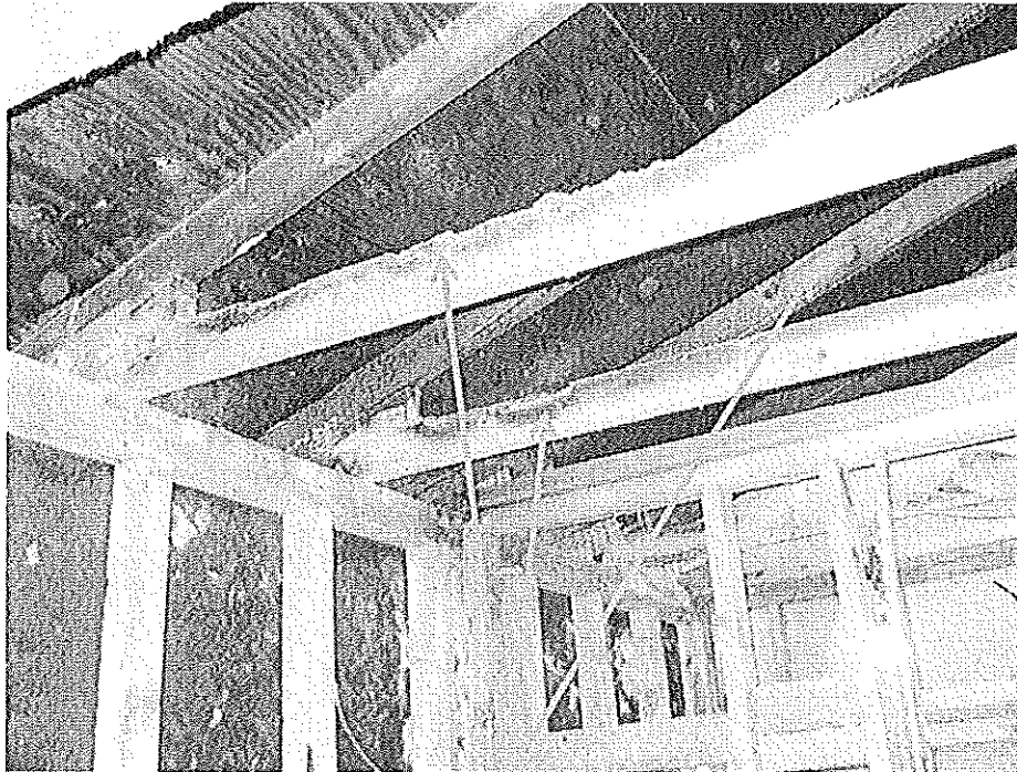
Fire Damaged Trusses requiring repair