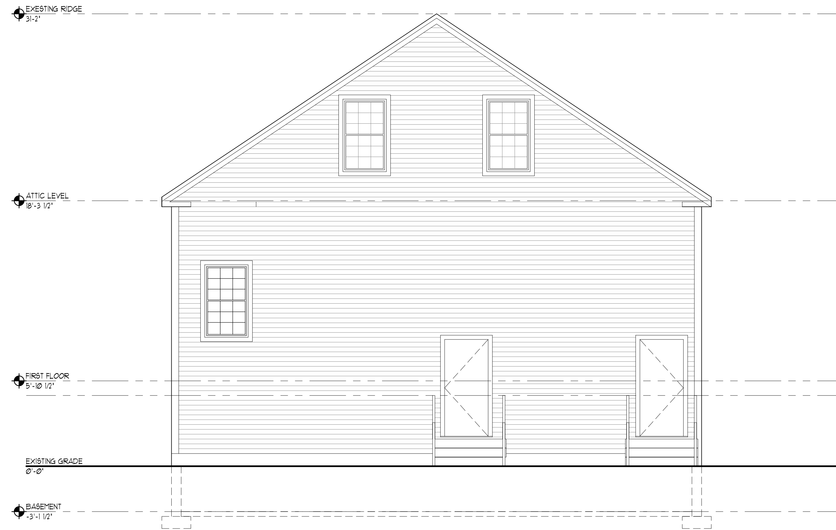
1 SOUTH ELEVATION A4 SCALE: 1/4" = 1'-0"