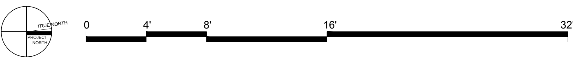
1 CONVENIENCE STORE - FIRST FLOOR PLAN 1/4" = 1'-0"