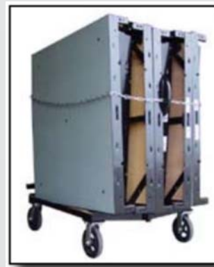
VERTICAL STORAGE CART - 40.5" L x 35" W x 53" H Fits through a 36" wide doorway Stores up to 10 stage decks upright