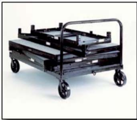
HORIZONTAL STORAGE CART - 60" L x 42" W x 38" H Stores up to 14 stage decks in a nested configuration

Store your decks conveniently and efficiently on Multi-Stage Storage Carts. Solid steel frame construction provides an easy way to transport your decks to and from set up sites.