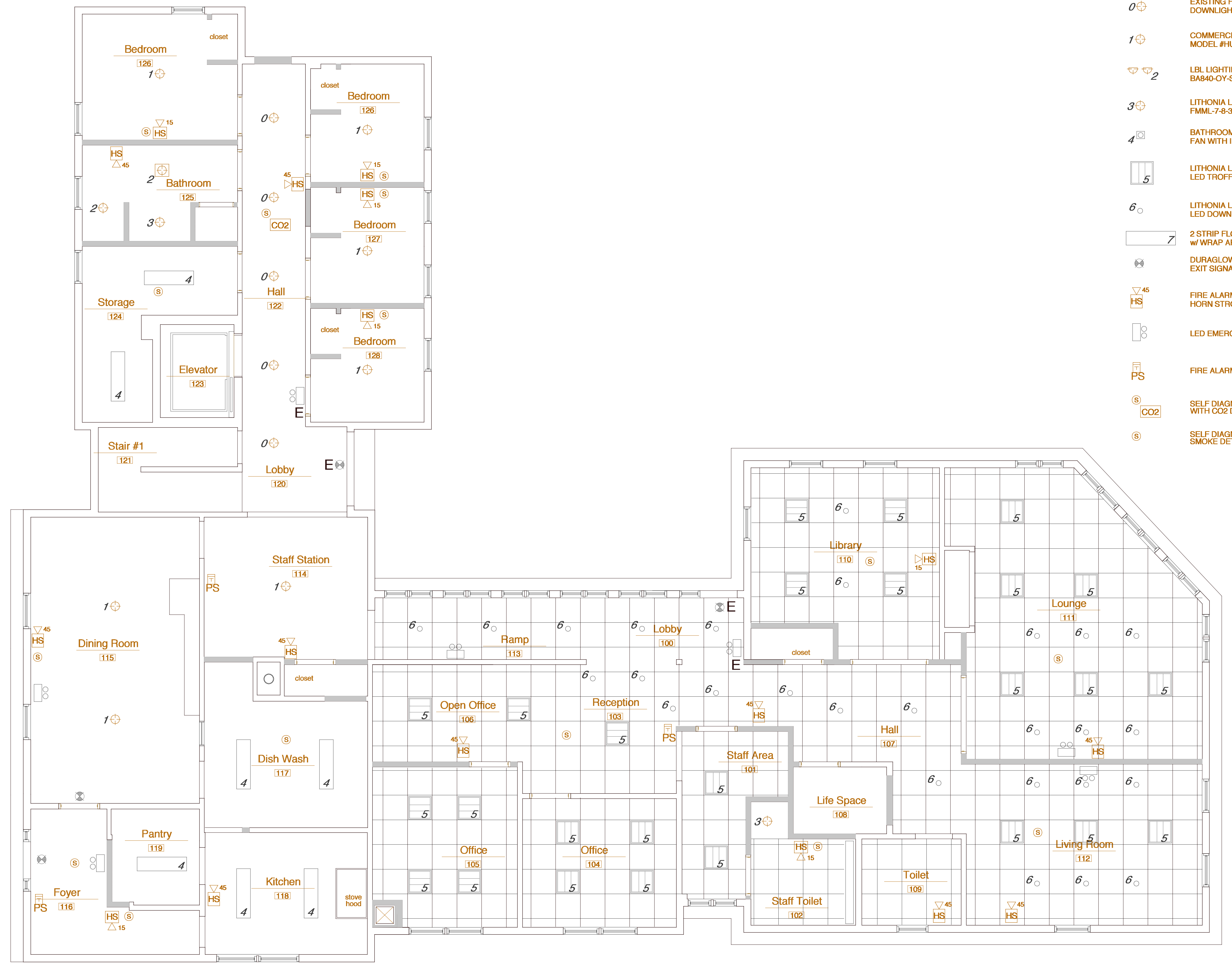
10 First Floor Reflected Ceiling Plan