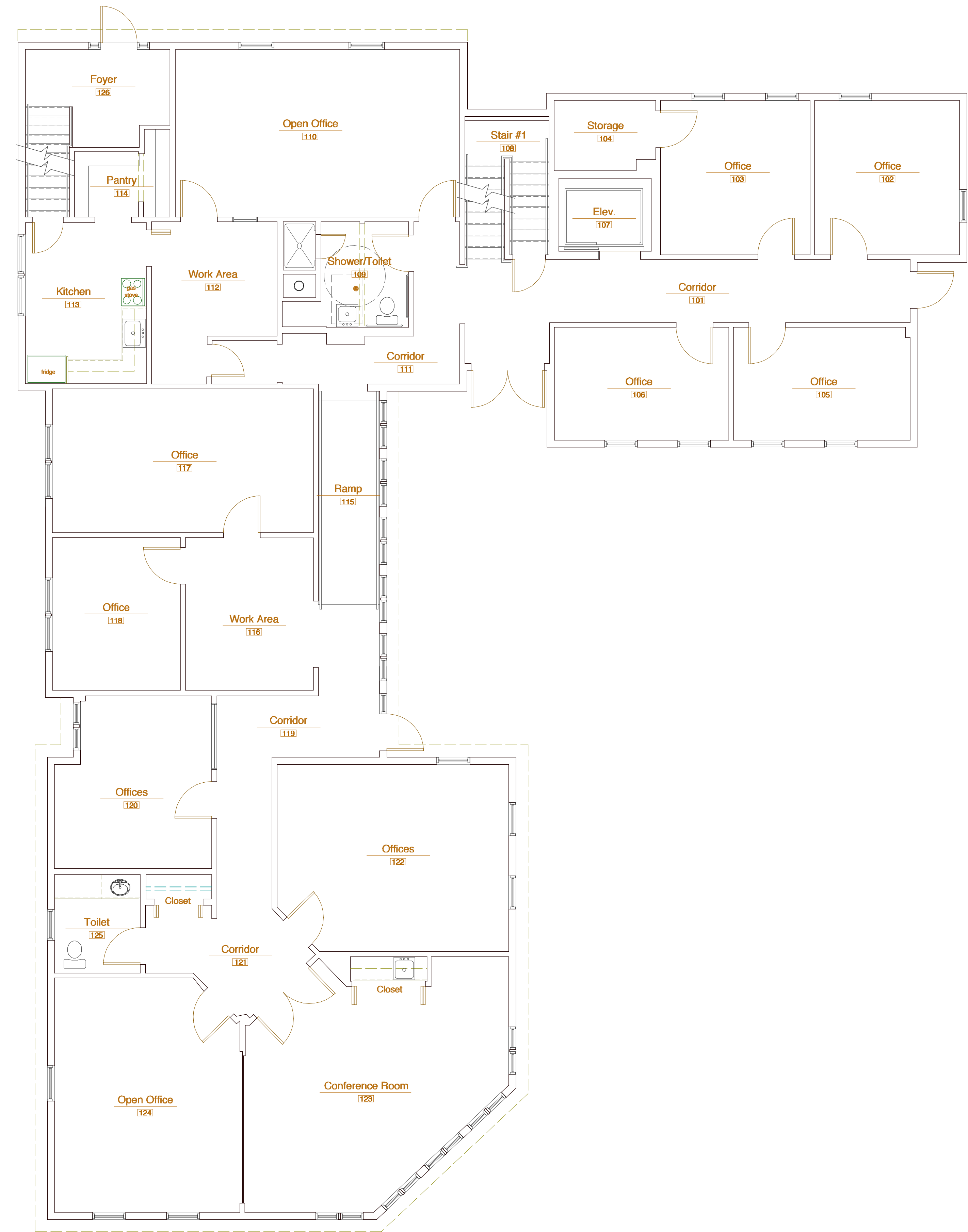
10 Existing Ground Floor Plan