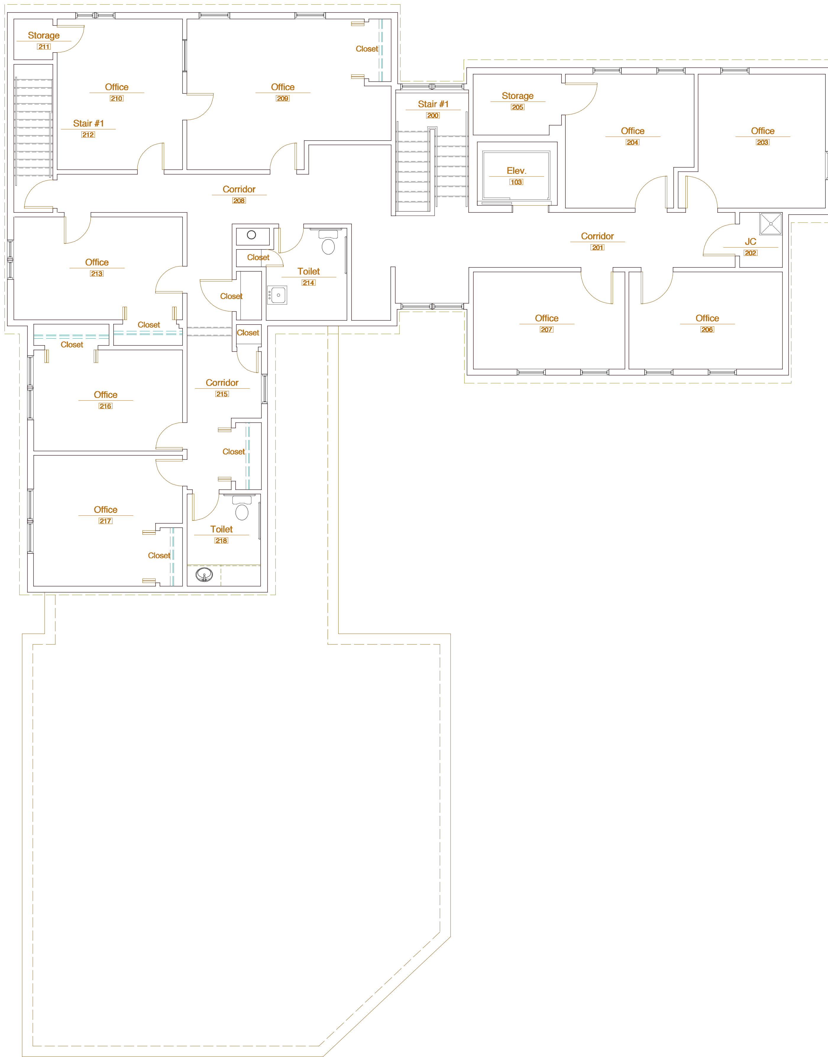
20 Existing Second Floor Plan