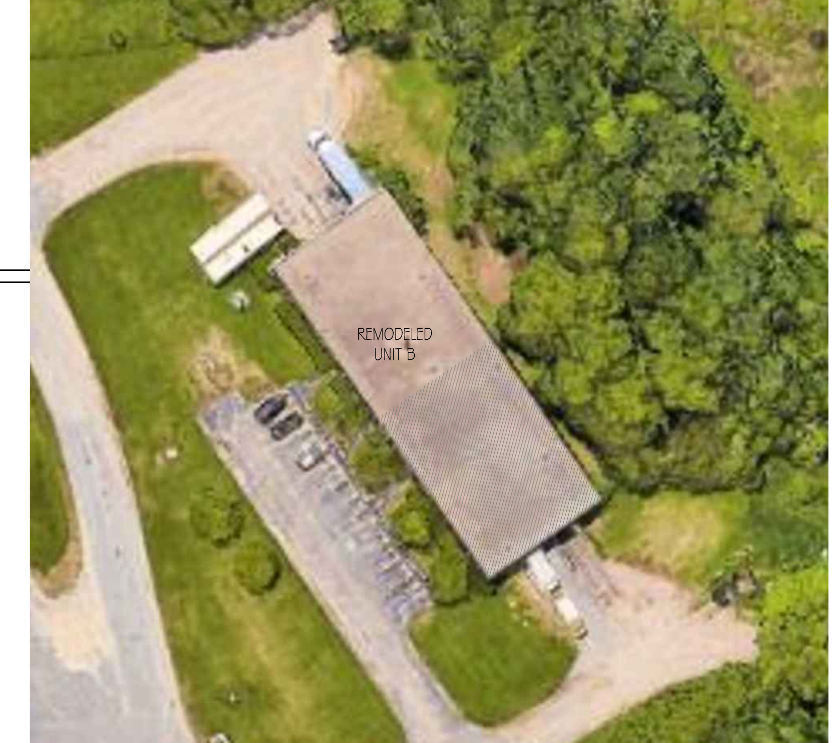
BUILDING MAP SCALE: NTS