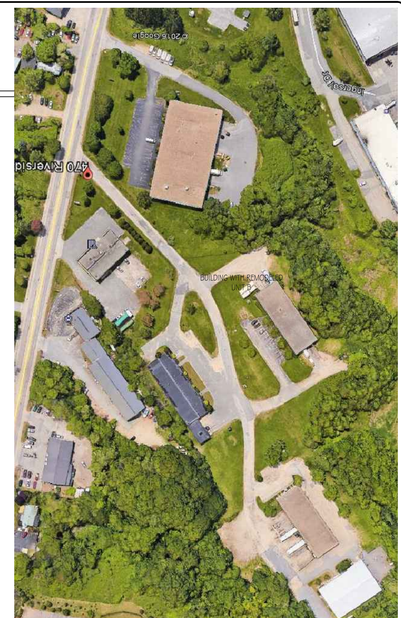
VICINITY MAP SCALE: NTS