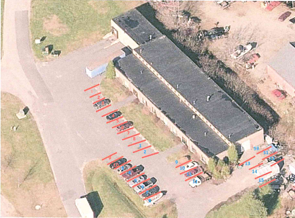
EXHIBIT A PARKING PLAN 470 Riverside Street, Portland

Dance Moves Maine, LLC , and it's customers and visitors shall park only in spaces marked in blue on the above photo. Other spaces in the lot may be used only if agreed to in writing by Landlord