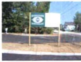
EXISTING TEMP SIGN SCALE: NTS

RECEIVED OCT 25 2010 Dept. of Building Inspections City of Portland Maine