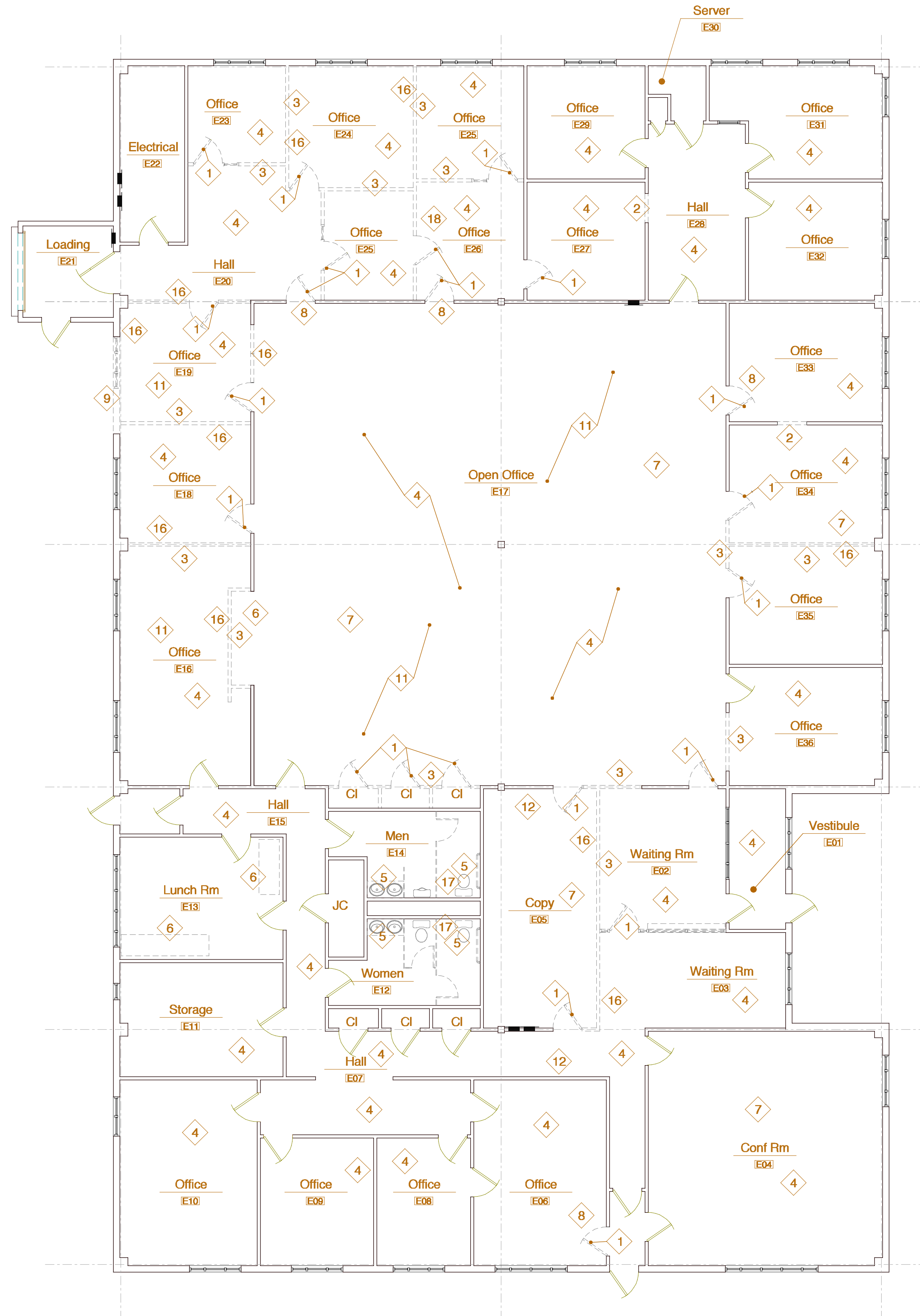
20 Demolition Plan 0 4 12 24