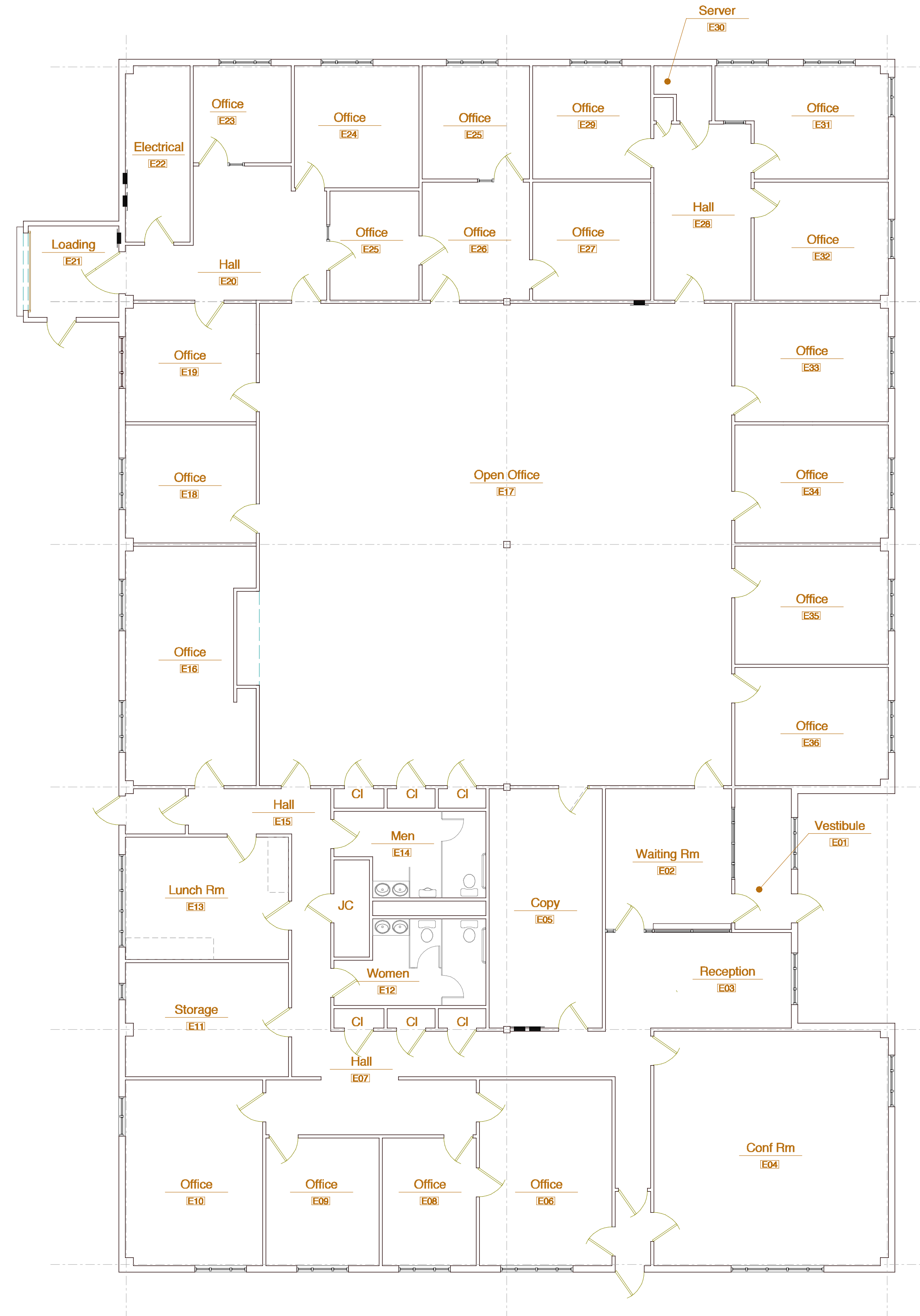
10 Existing Conditions Plan 0 4 12 24

--- wall construction to be demolished or removed = interior or exterior wall construction to remain