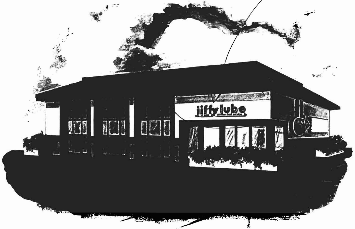
6'-Wall-Mount Logo Sign with 3'-8" Wall-Mount Readerboard