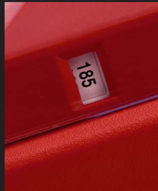
8 candela settings