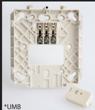
Common base for wall and ceiling with 5 mounting options