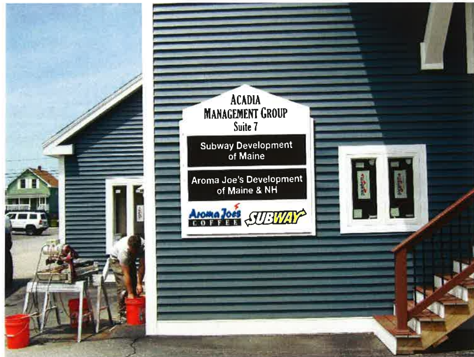
PROPOSED / PHOTO COMPOSITE SCALE: NONE