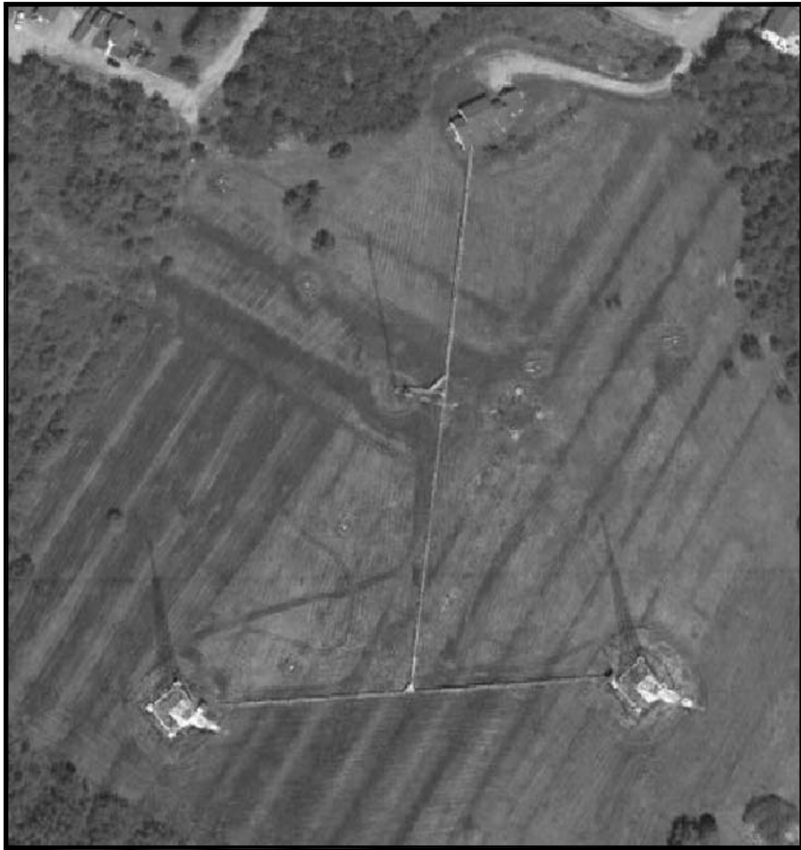
PROJECT AERIAL VIEW SEE SITE PLAN, DWG G-101

WGAN TRANSMITTER SITE 236 LANE AVENUE PORTLAND, ME 04103 CUMBERLAND COUNTY