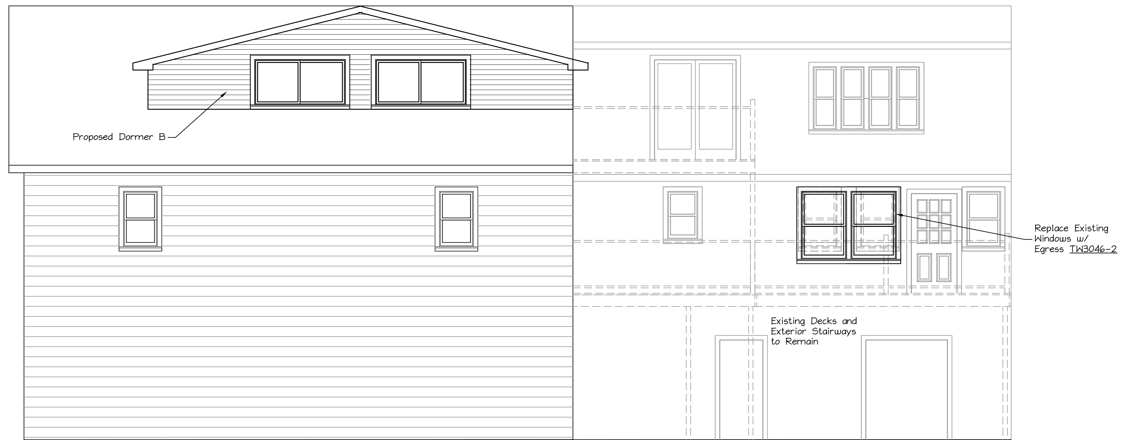
REAR ELEVATION Scale: 1/4" = 1'-0"