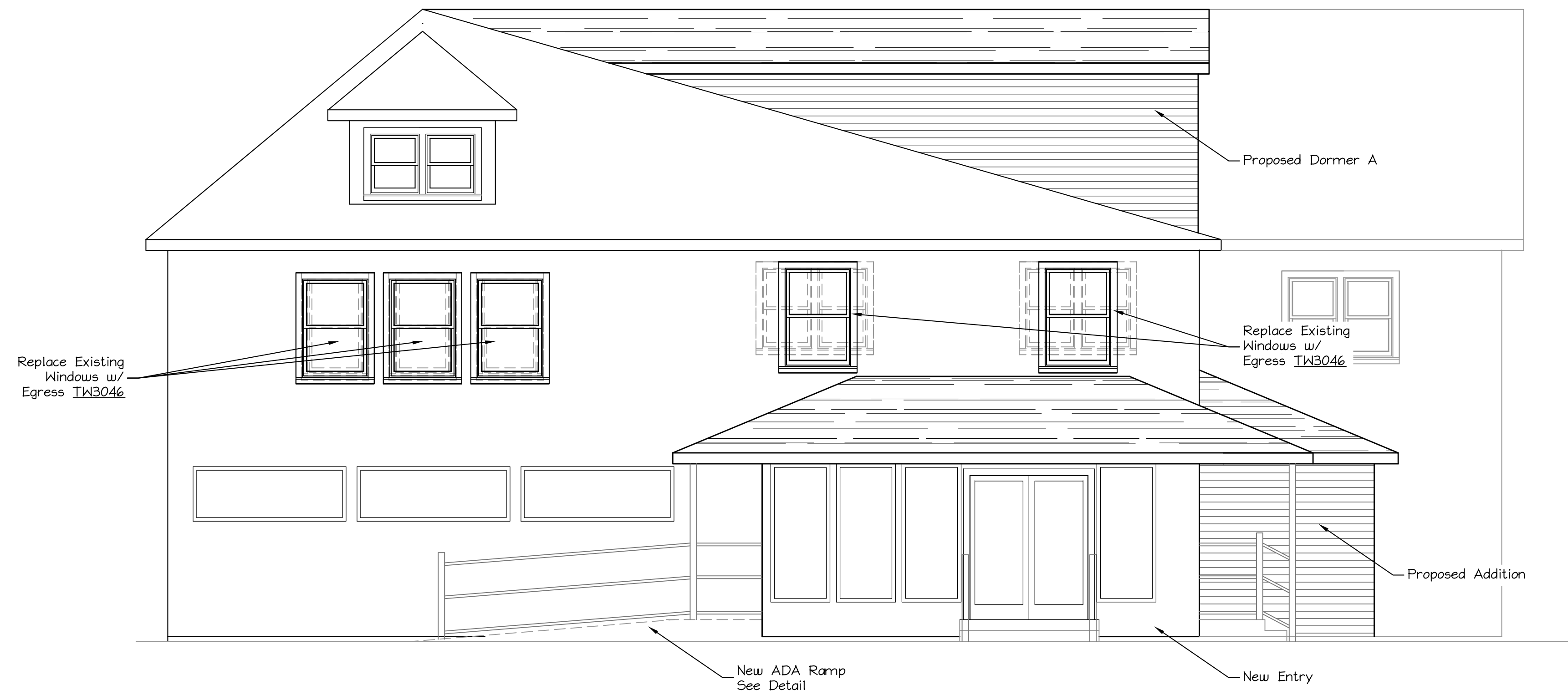
FRONT (FOREST AVE.) ELEVATION Scale: 1/4" = 1'-0"