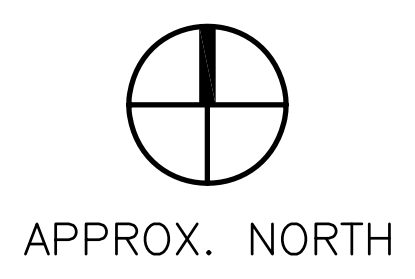
1 COMPOUND PLAN SCALE: 1/4" = 1'-0"