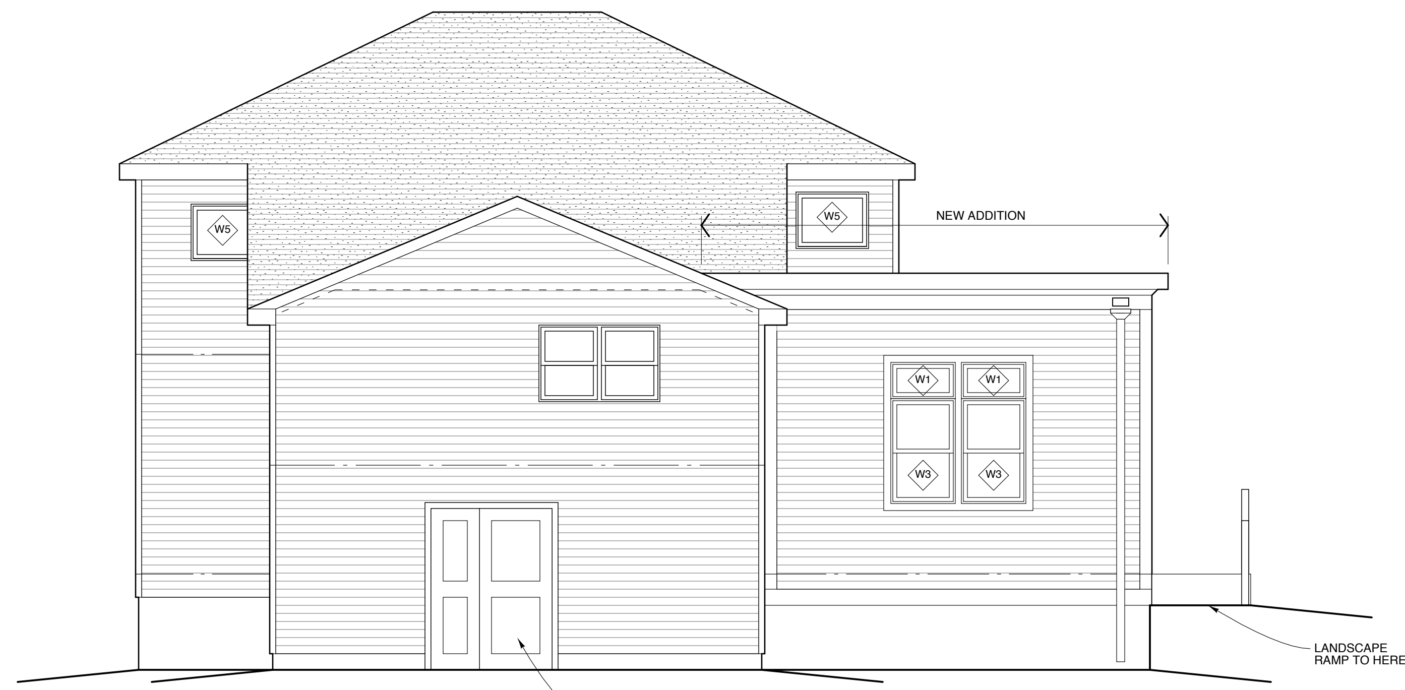
1 NORTH ELEVATION SCALE: 1/4" = 1'-0" 1' 2' 4' 8'

NEW DOOR & SIDELIGHT IN EXISTING OPENING