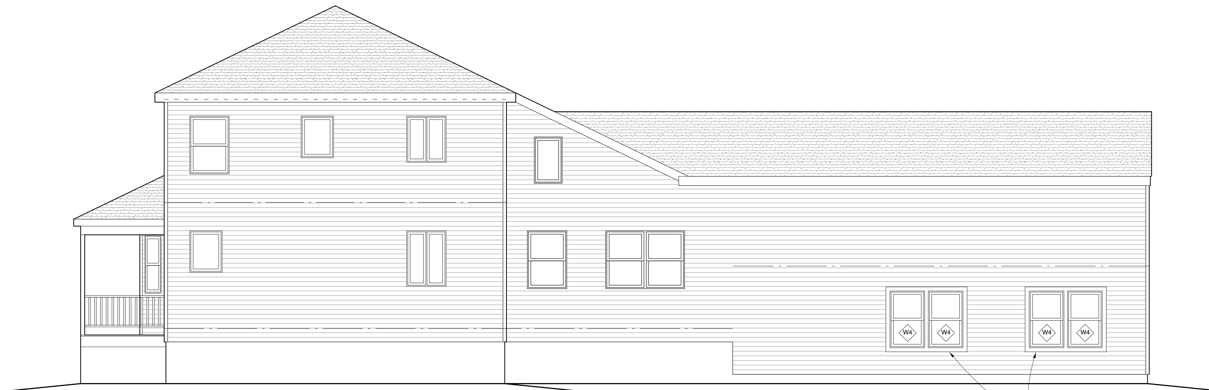
2 EAST ELEVATION SCALE: 1/4" = 1'-0" 1' 2' 4' 8'