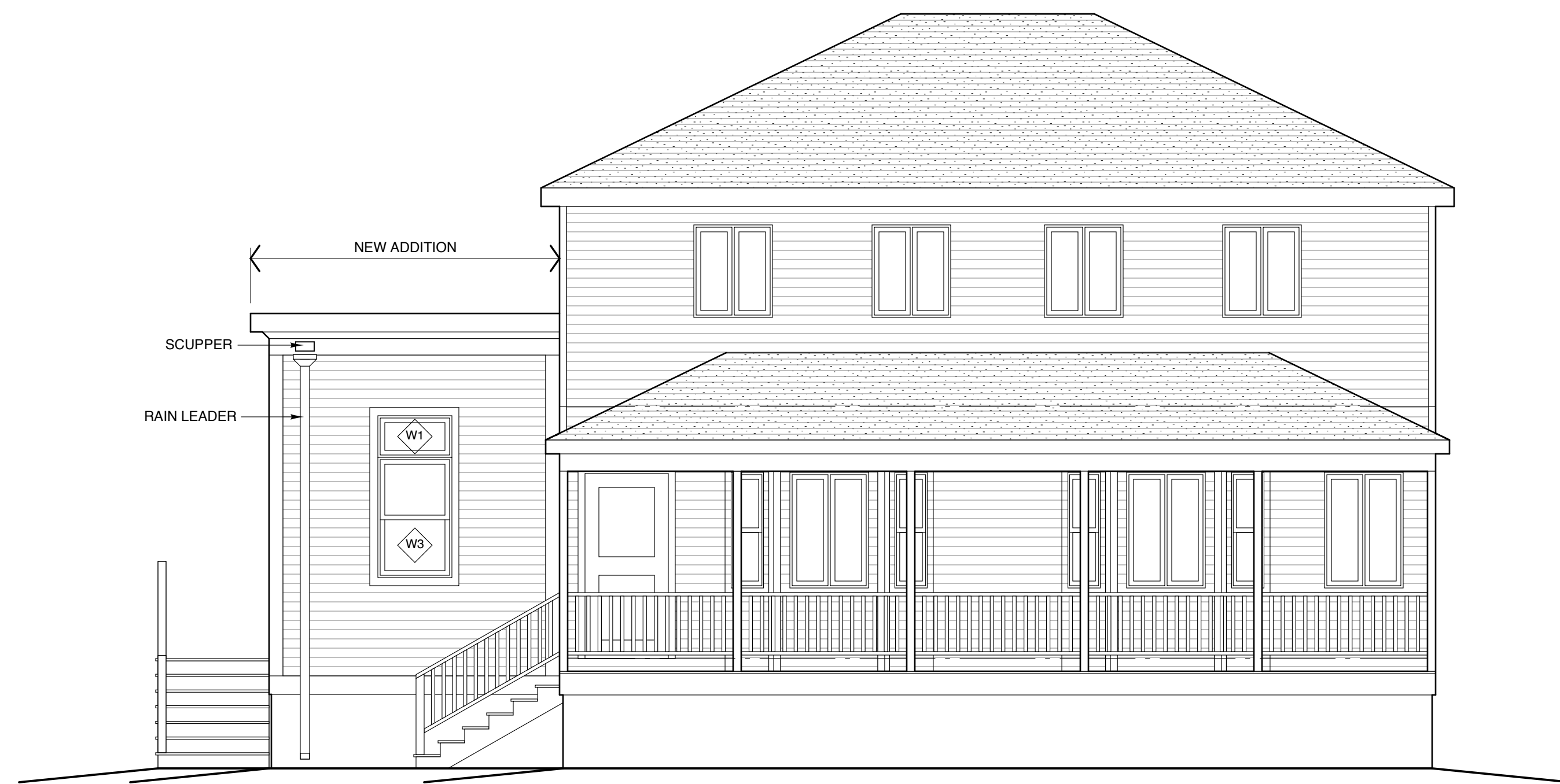
1 SOUTH ELEVATION SCALE: 1/4" = 1'-0" 1' 2' 4' 8'