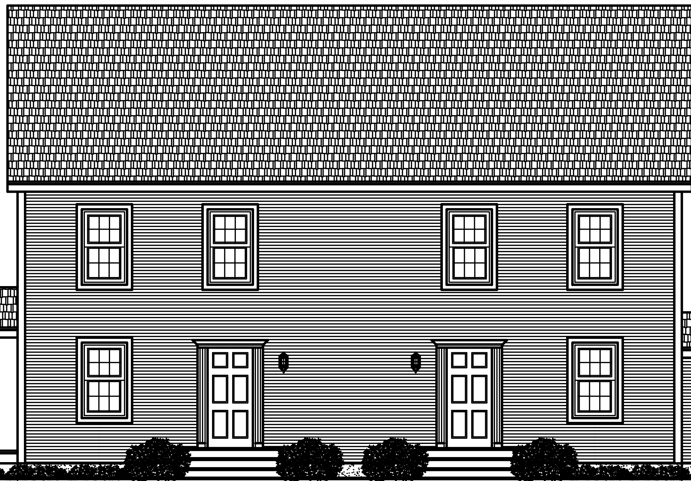
FRONT ELEVATION 1/4"=1'-0"