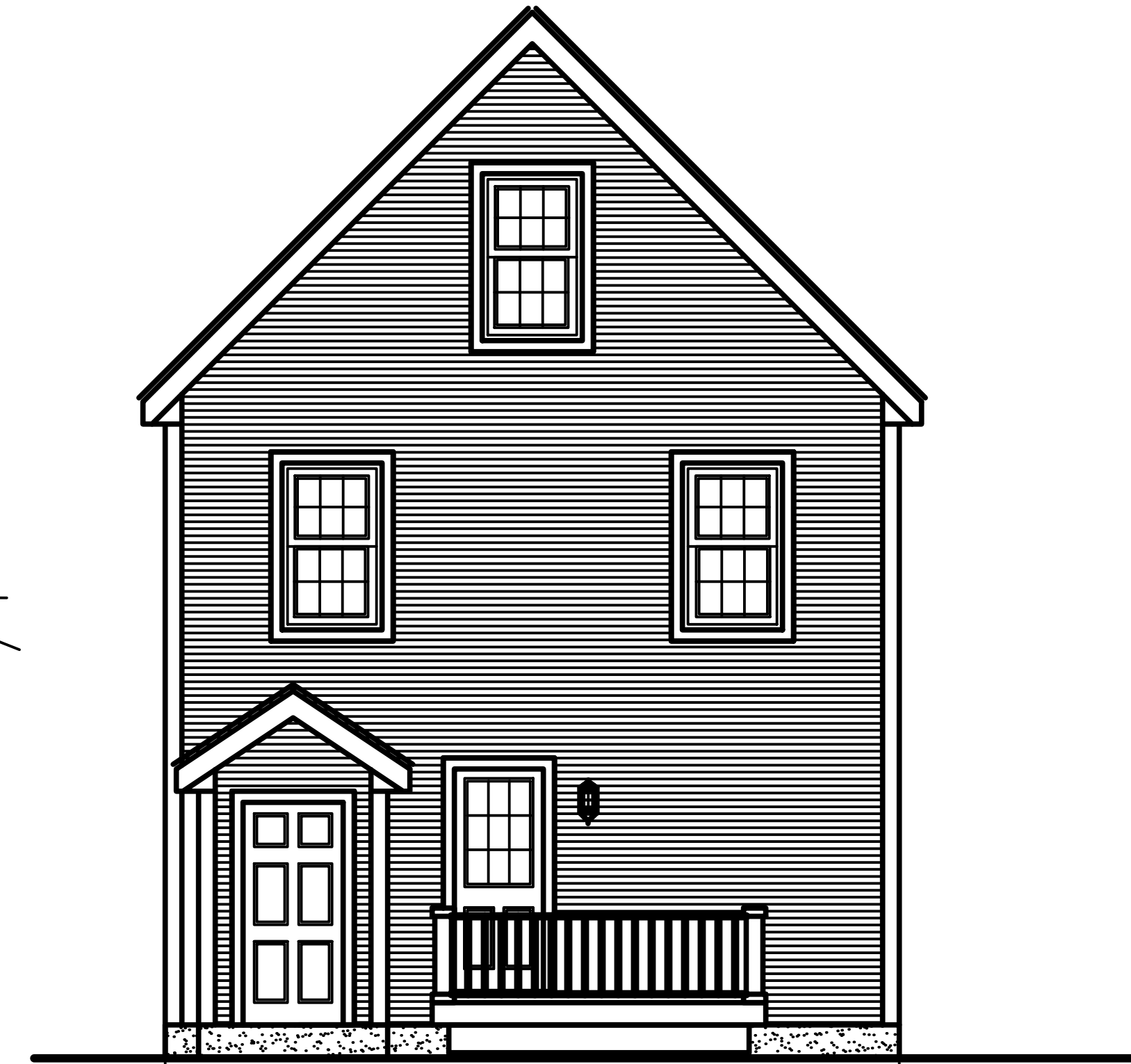
RIGHT ELEVATION 1/4"=1'-0"