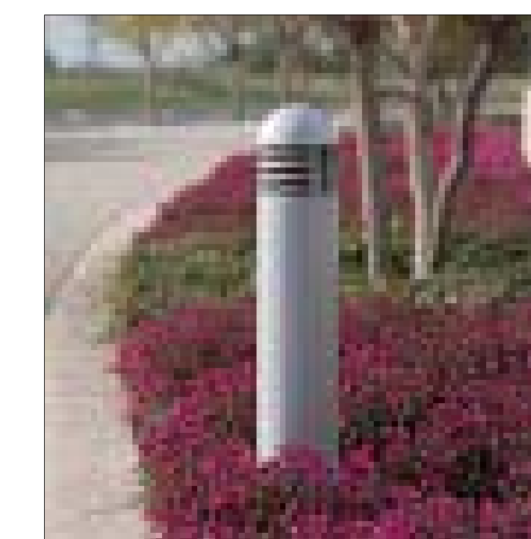
KIM LED BOLLARD