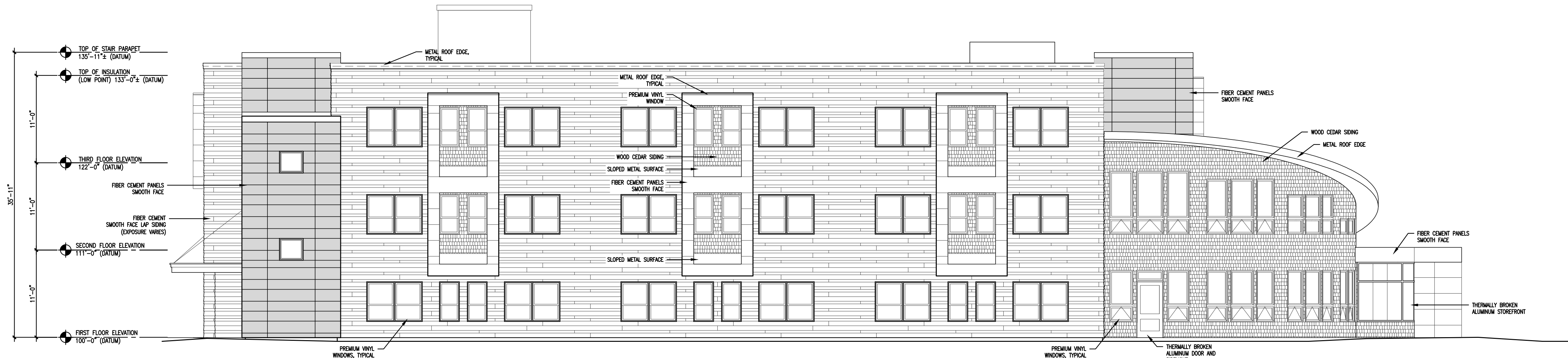
A5 SOUTH ELEVATION