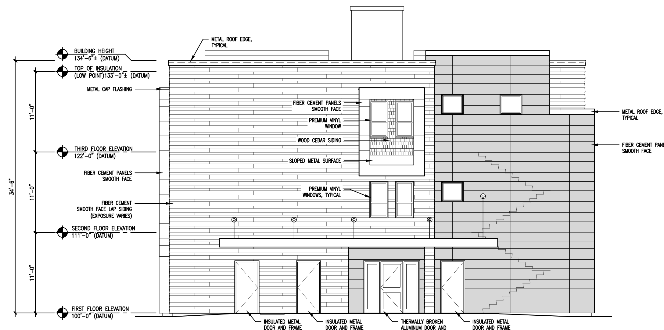
E3 WEST ELEVATION