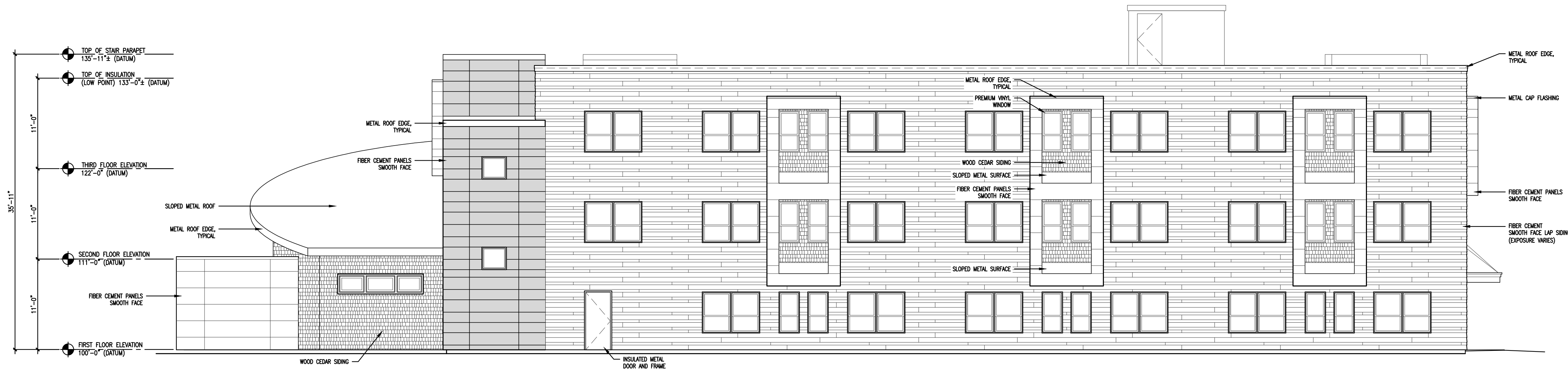
A2 NORTH ELEVATION