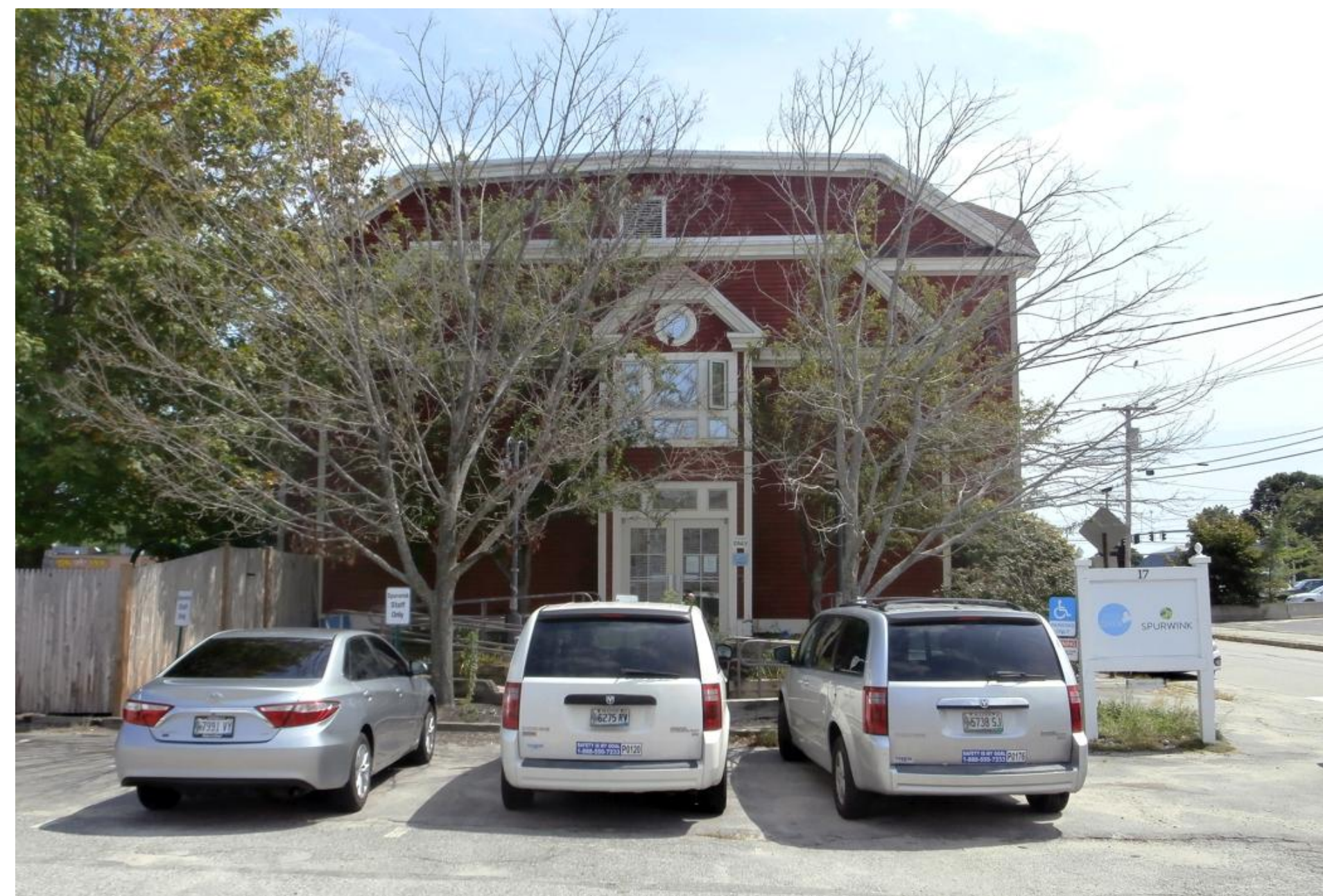
4 BUILDING FROM WEST A0.2