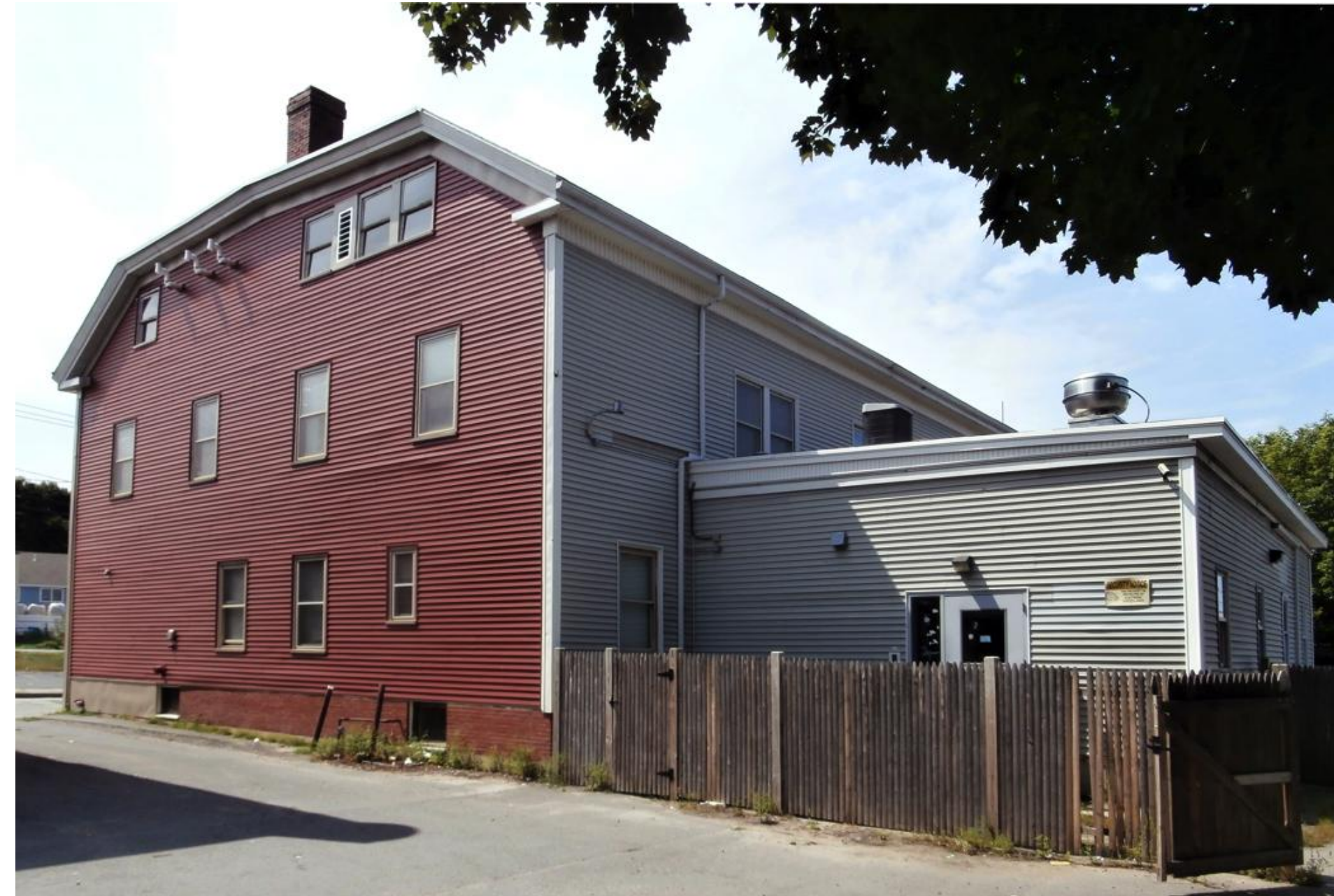
2 BUILDING FROM EAST A0.2