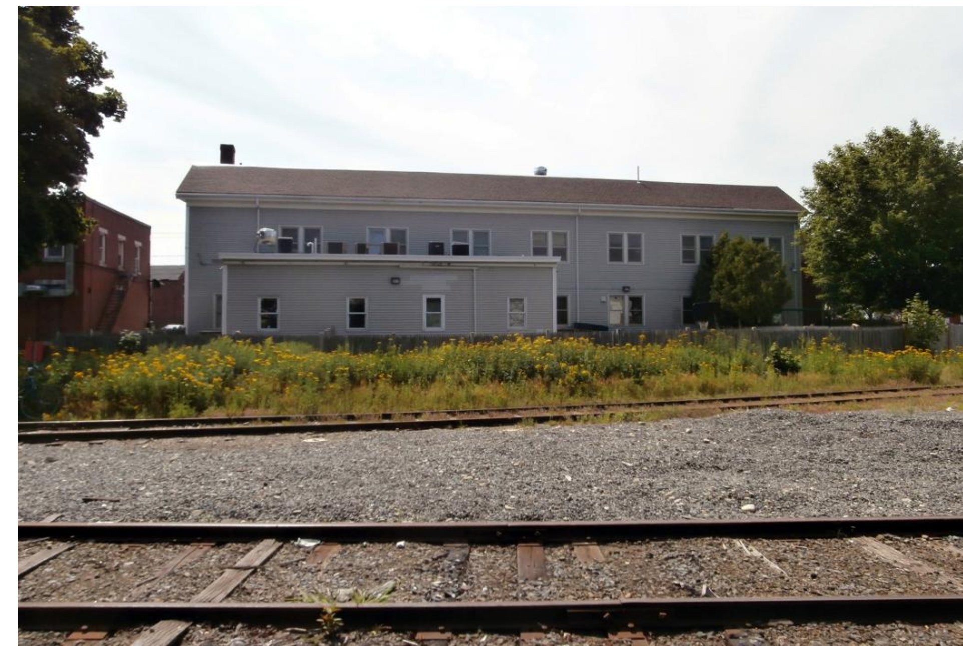
3 BUILDING FROM NORTH A0.2