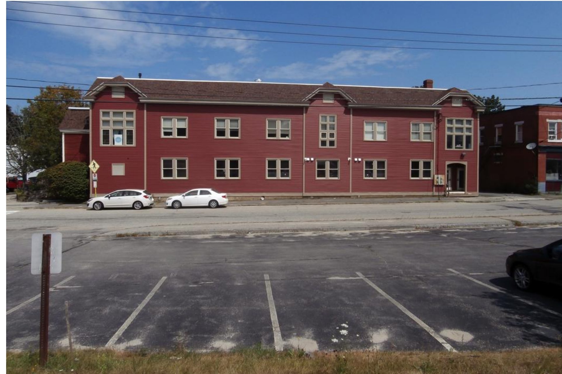
1 BUILDING FROM SOUTH - BISHOP STREET A0.2