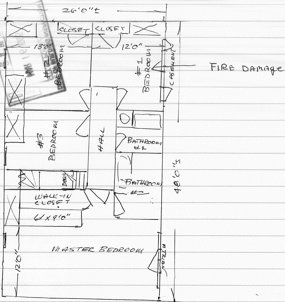
2ND FLOOR PLAN 1/8" SCALE ±