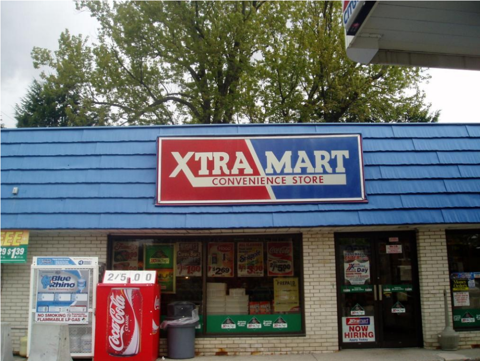
Existing Building Image