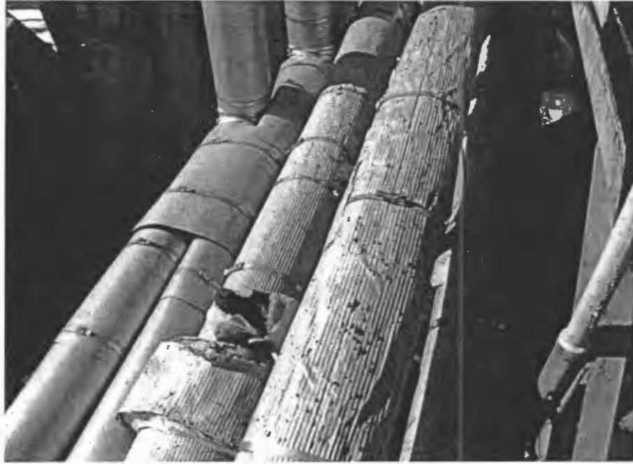
PHOTO 3 Non-ACM pipe insulation in smooth & corrugated aluminum covers