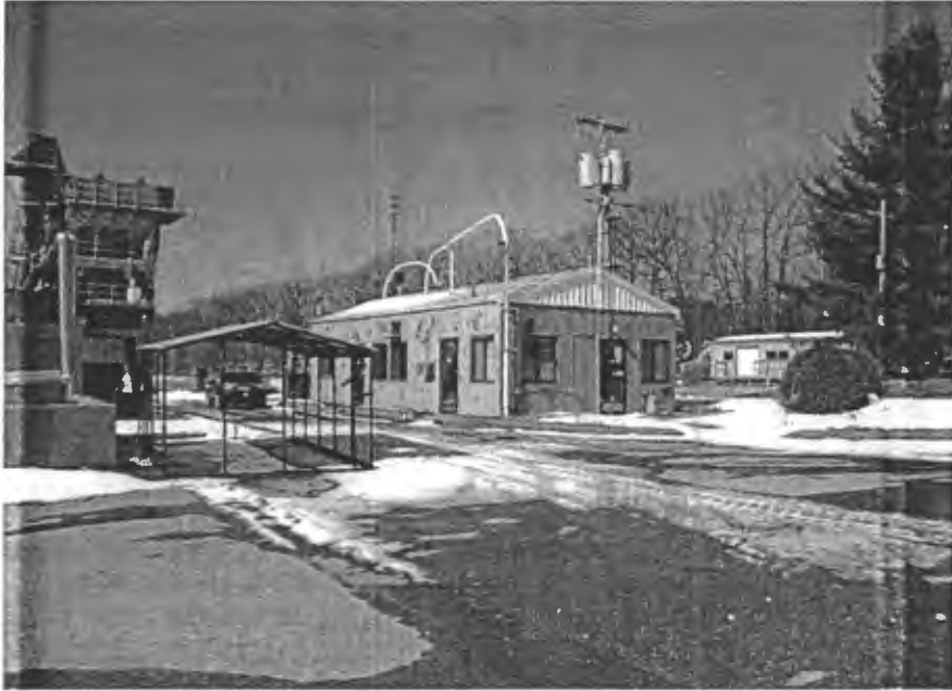
PHOTO 2 Out buildings not included in survey