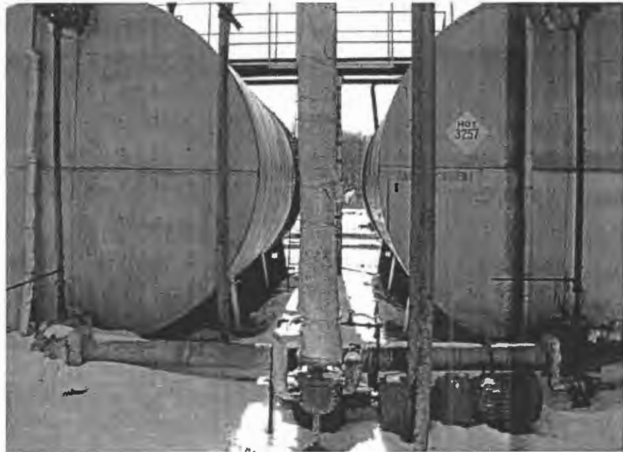
PHOTO 4 Non-ACM pipe & tank insulation