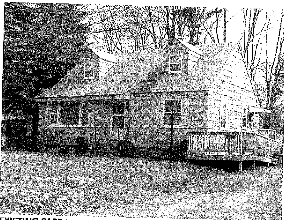
EXISTING CAPE (H.C. RAMP REMOVED)