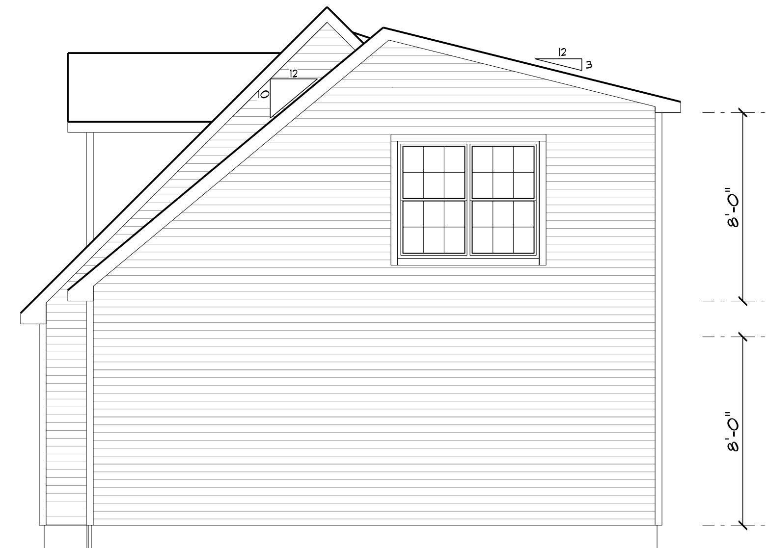
RIGHT ELEVATION SCALE: 1/4" = 1'-0"

DRAWINGS ARE PROVIDED BY HAMMOND LUMBER COMPANY AS A SERVICE TO OUR CUSTOMERS. THESE DRAWINGS ARE NOT TO BE USED FOR CONSTRUCTION AND ARE NOT TO BE USED AS A BASIS FOR CONSTRUCTION AND HAMMOND LUMBER COMPANY DISCLAIMS ANY RESPONSIBILITY IF THEY ARE SO USED.