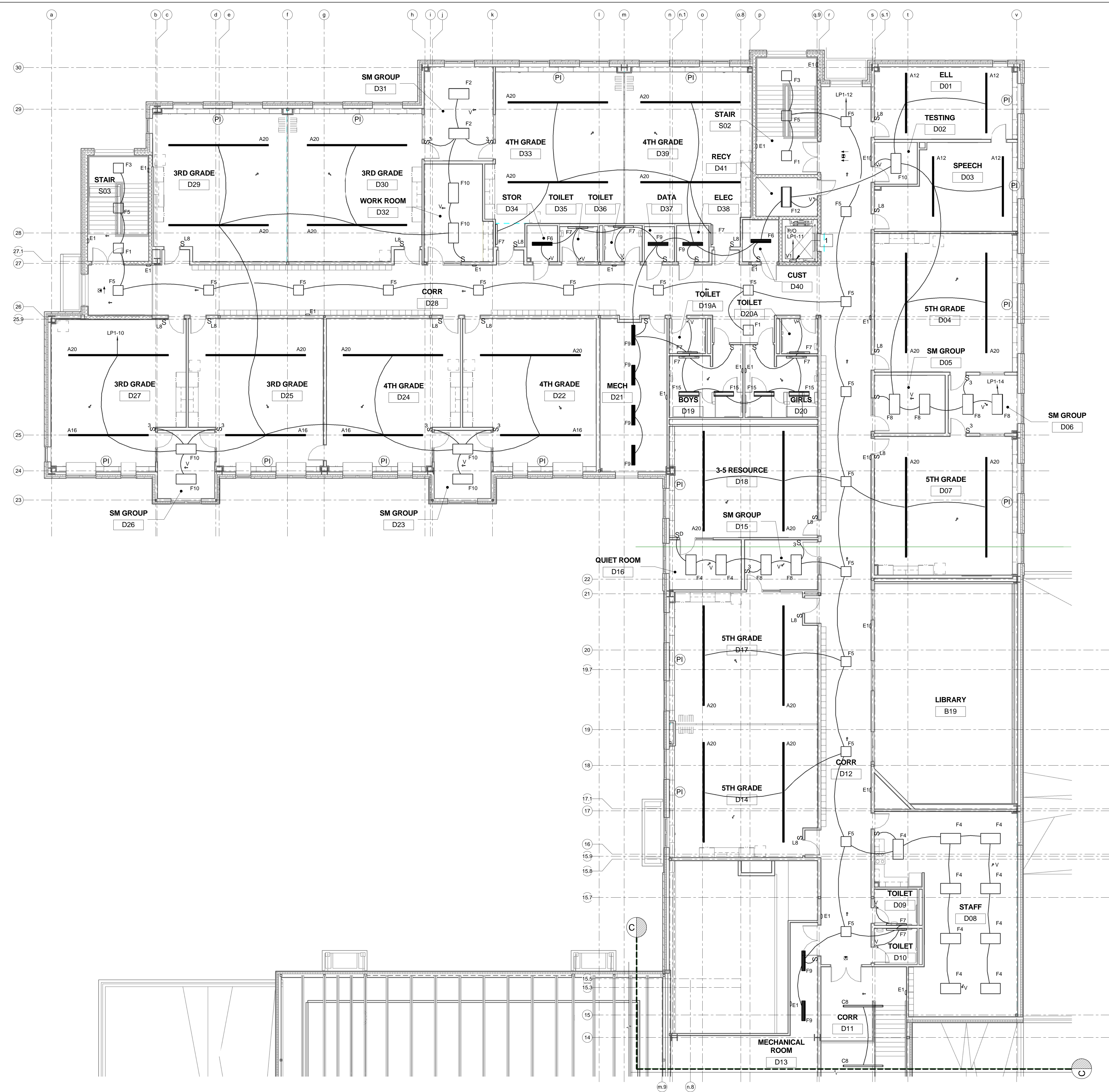
1 SECOND FLOOR LIGHTING PART PLAN D EL104 SCALE: 1/8" = 1'-0"