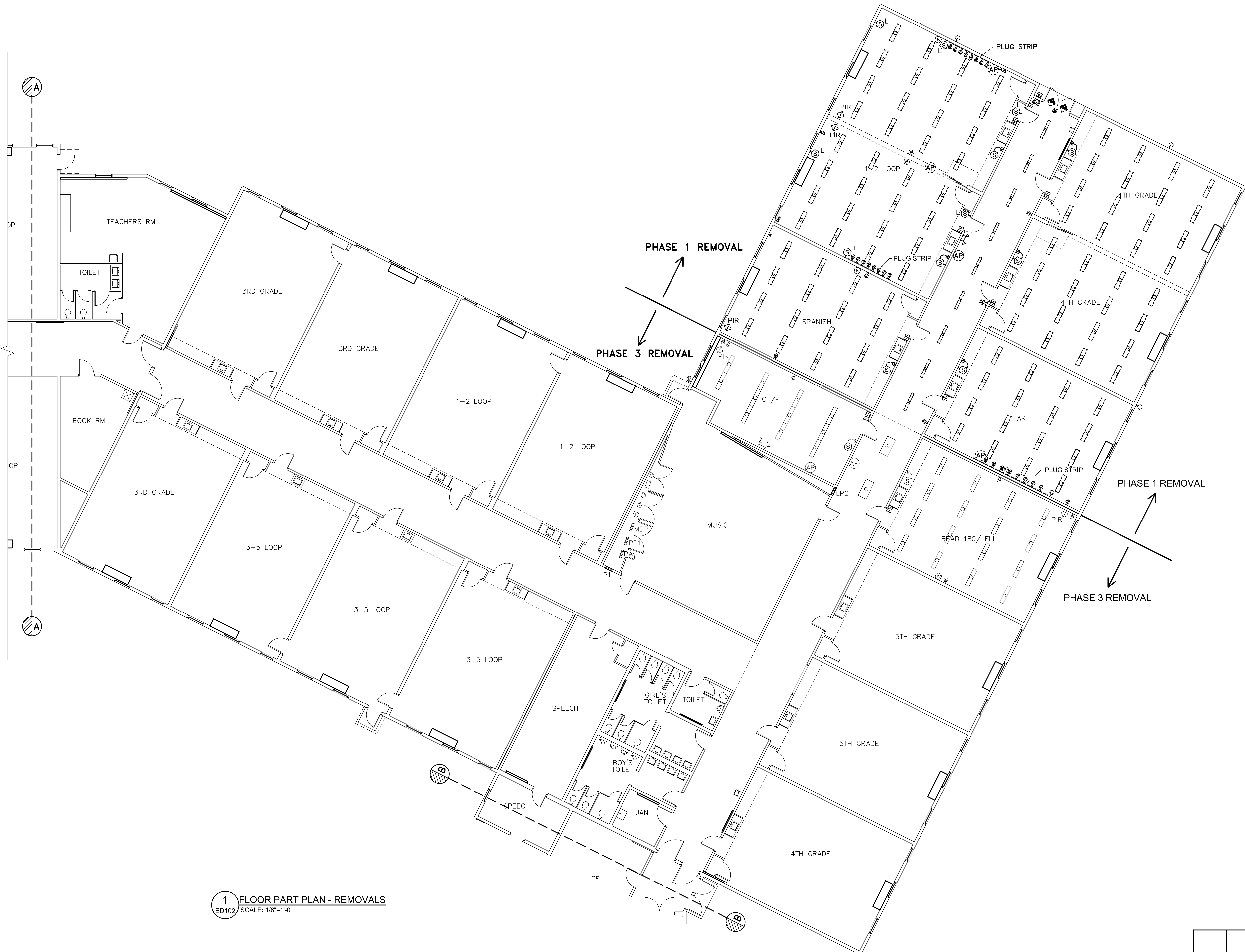
1 FLOOR PART PLAN - REMOVALS ED102 SCALE: 1/8"=1'-0"

DRAWING NOTE REMOVE ELECTRICAL DEVICES AND ASSOCIATED WIRING AND CONDUIT DURING PHASE 1. THE REMAINDER OF THE BUILDING SHALL REMAIN FULLY OPERATIONAL DURING PHASES 1 AND 2. REMOVE REMAINDER OF BUILDING IN PHASE 3.