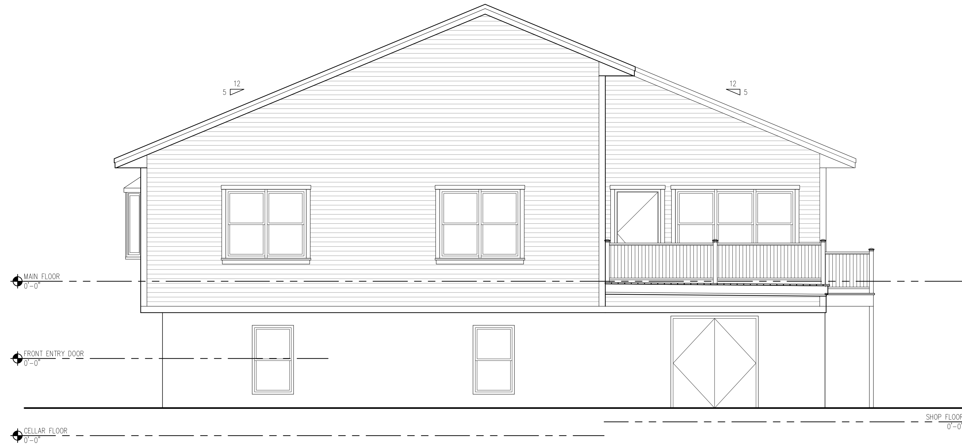
1 RIGHT ELEVATION A7 SCALE: 1/4" = 1'-0"