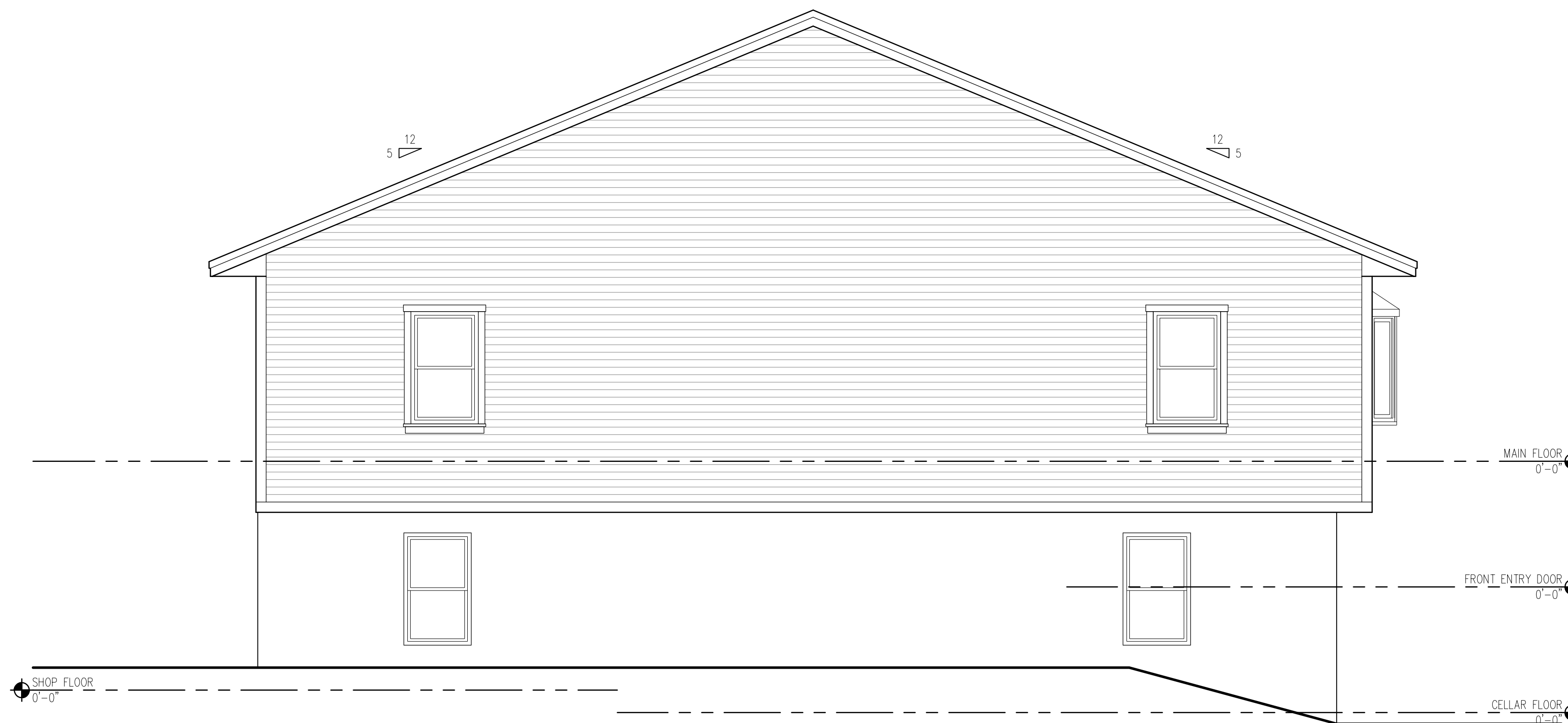
2 LEFT ELEVATION A7 SCALE: 1/4" = 1'-0"

NOTE: THIS DRAWING IS PROVIDED FOR INFORMATIONAL PURPOSES ONLY. IF USED FOR CONSTRUCTION, THE CONTRACTOR ASSUMES ALL RESPONSIBILITY FOR LOCAL CODE COMPLIANCE. ALL DRAWINGS, PLANS, SKETCHES ETC. ARE PROVIDED TO OUR CLIENTS BASED UPON INFORMATION PROVIDED BY THE CLIENT AND DRAWN IN ACCORDANCE WITH COMMON BUILDING PRACTICES AND LOCAL CODES. NONE OF THE EMPLOYEES OF FMC CADD DRAFTING SERVICES, INC. ARE REGISTERED ARCHITECTS, ENGINEERS OR LAND SURVEYORS. ALL DIMENSIONS AND SPECIFICATIONS SHOULD BE VERIFIED BY CLIENT AND/OR CONTRACTOR BEFORE ACTUAL CONSTRUCTION BEGINS. IF DIMENSIONS AND SPECIFICATIONS ARE NOT VERIFIED BY CLIENT AND/OR CONTRACTOR BEFORE ACTUAL CONSTRUCTION BEGINS FMC CADD DRAFTING SERVICES, INC. WILL BE HELD HARMLESS FMC CADD DRAFTING SERVICES, INC. ASSUMES NO LIABILITY FOR CHANGES AND/OR REVISIONS MADE TO PLANS BY CLIENT AND/OR CONTRACTOR.