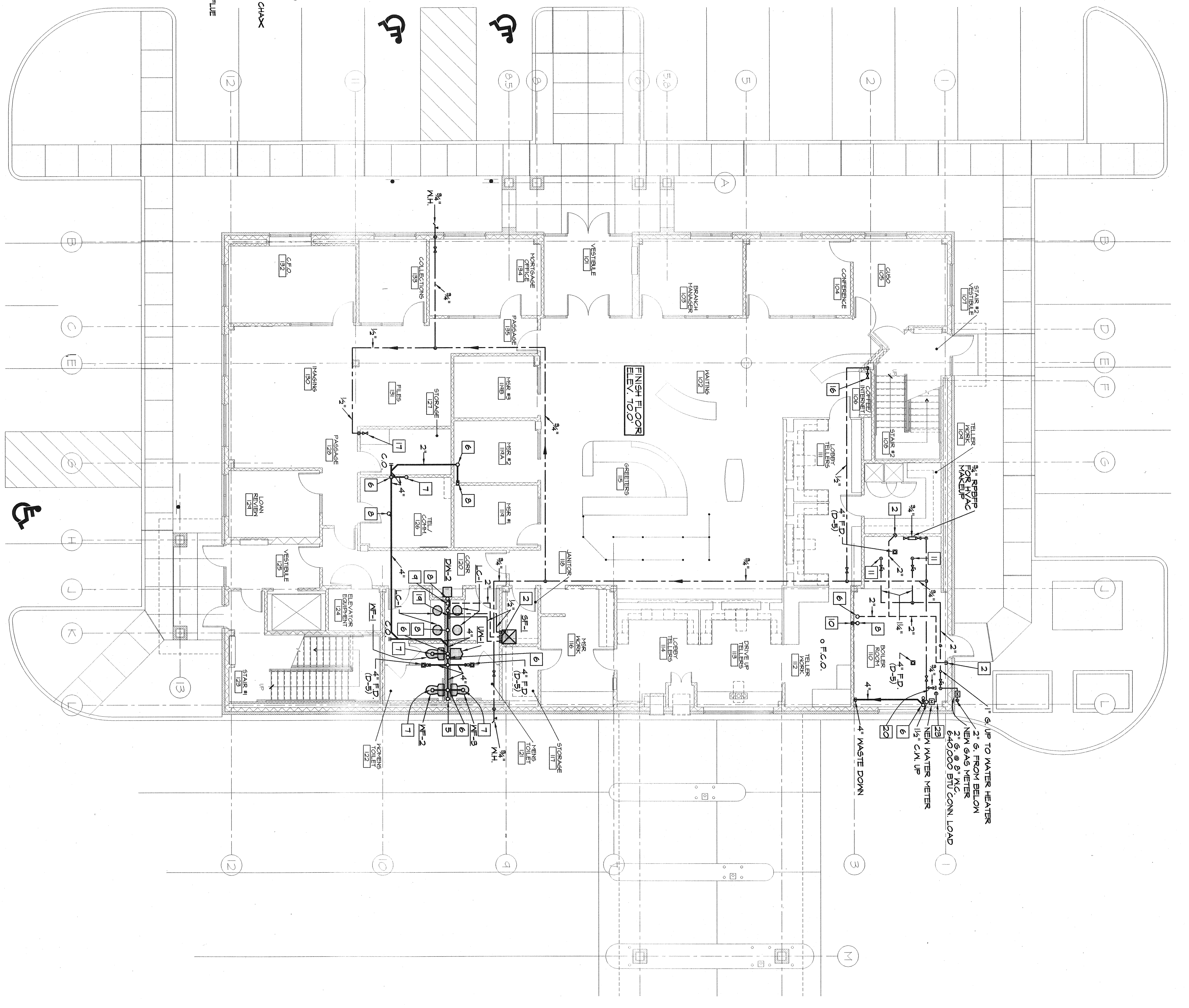
FIRST FLOOR PLAN SCALE: 1/8" = 1'-0"