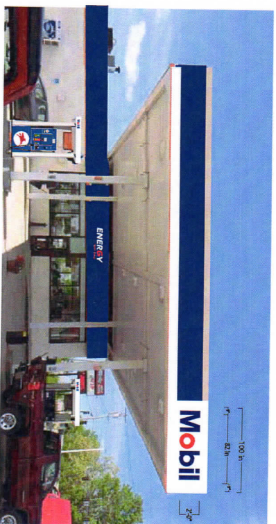
MOBIL GRAPHICS CANOPY B

BUILDING FASCIA GRAPHICS 24" X 96" 16 SF X 2 = 32 SF