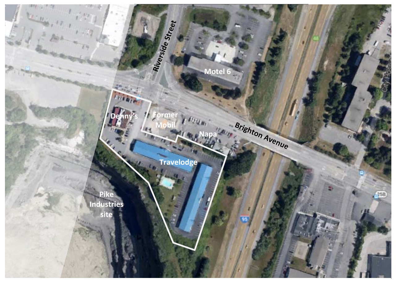
Figure 1: 1210 Brighton Avenue site, existing conditions

Altogether, the site is over three acres in size and includes land held by Denny's restaurant under a long-term lease agreement. At present, a 135-room Travelodge motel sits on the eastern three quarters of the site, with Denny's occupying the parcel's remainder. Surface parking surrounds both of these uses, and the vast majority of the site is currently impervious. Pedestrian and vehicular access is via a light at the Brighton Avenue/Riverside Street intersection.