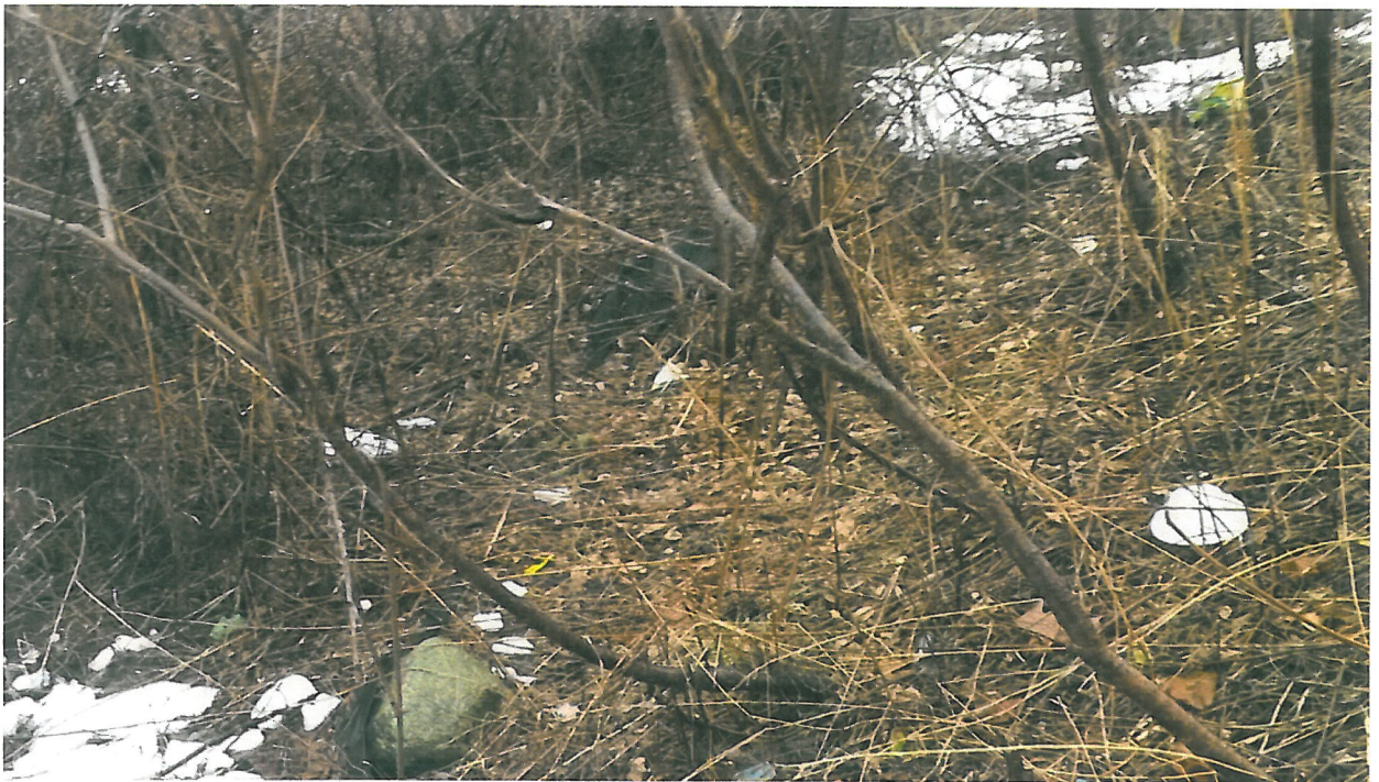
Typical Vegetation in the Area