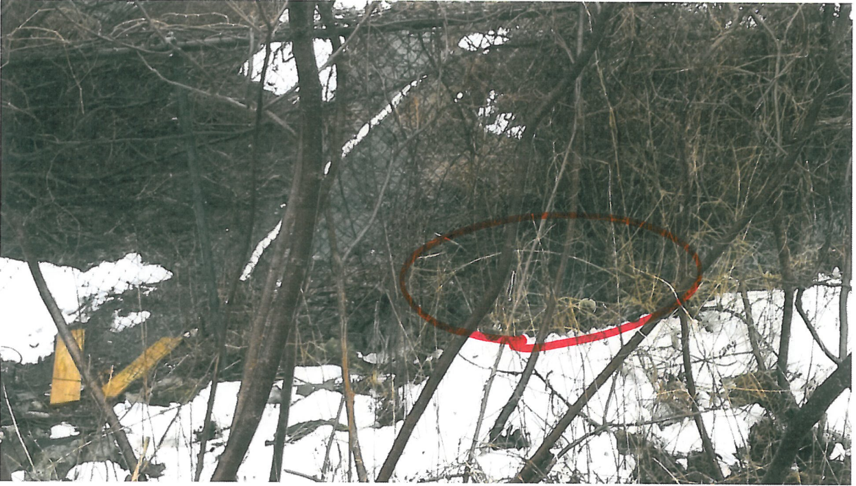
Culvert Outlet Area