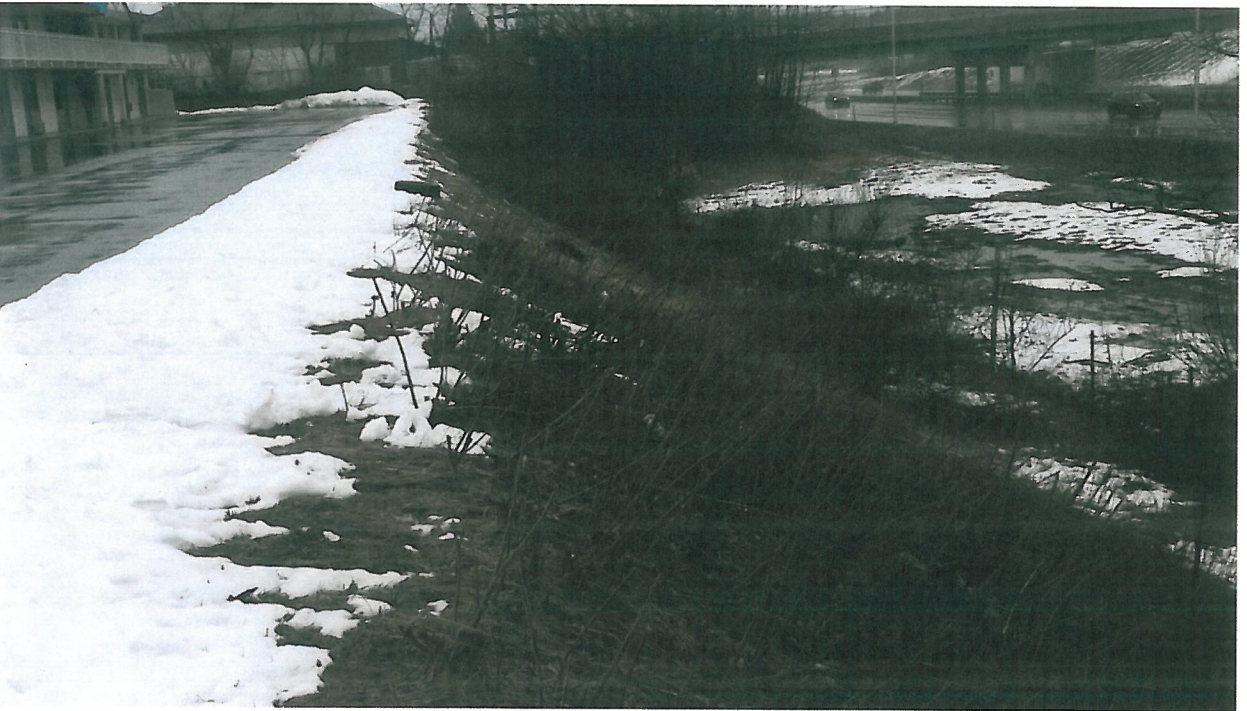
Side Slope towards Route 95