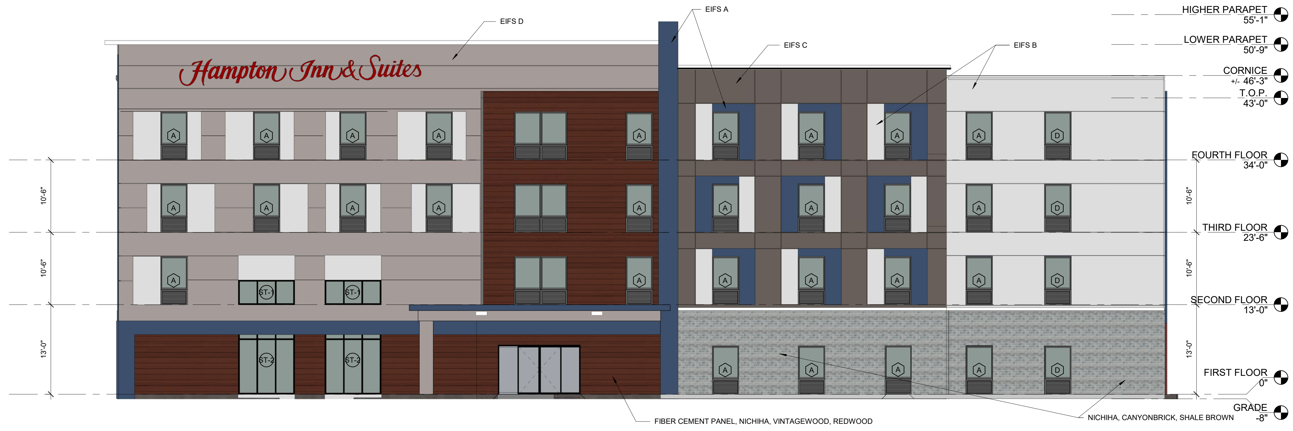
1 | NORTH ELEVATION 1/8" = 1'-0"

EIFS A - STO CLASSIC - CADET - 35333-35 EIFS B - STO CLASSIC - STO WHITE - 9433-80 EIFS C - STO CLASSIC - DIAMOND DUST - 20822-56 EIFS D - STO CLASSIC - GRAY DAWN - 33137-71 EIFS E - STO CLASSIC - CORAL - 33120-25