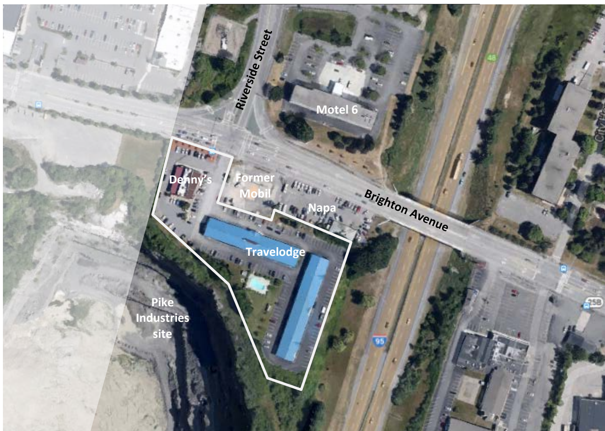
Figure 1: 1210 Brighton Avenue site, existing conditions

Altogether, the site is over three acres in size and includes land held by Denny's restaurant under a long-term lease agreement. At present, a 135-room Travelodge motel sits on the eastern three quarters of the site, with Denny's occupying the parcel's remainder. Surface parking surrounds both of these uses, and the vast majority of the site is currently impervious. Pedestrian and vehicular access is via a light at the Brighton Avenue/Riverside Street intersection.