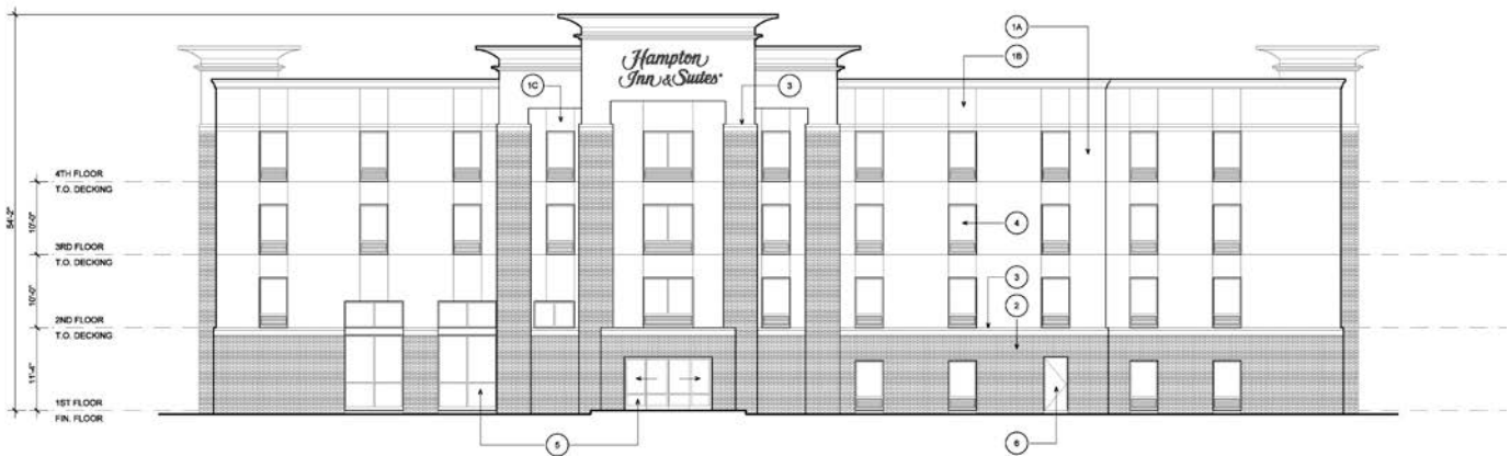
Figures 2 and 3: 1210 Brighton Avenue site from Brighton Avenue, with Denny's (at right), former Mobil station lot (center), and Napa Auto Care Center (left); Elevation showing proposed hotel from Brighton Avenue (bottom)