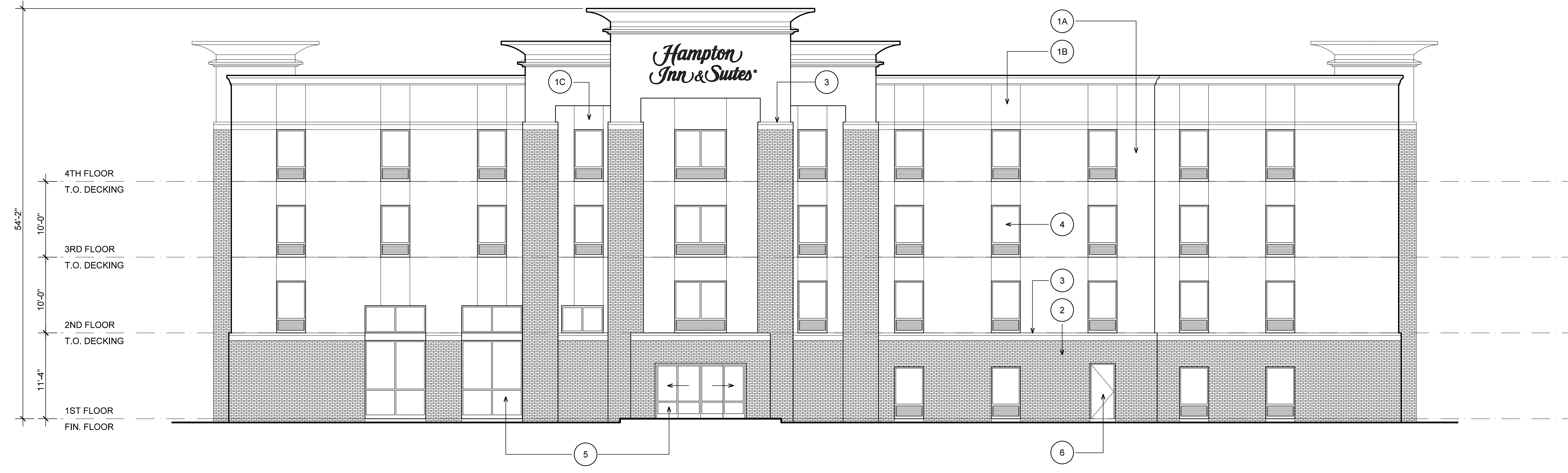
NORTH ELEVATION 1/8" = 1'-0" B1