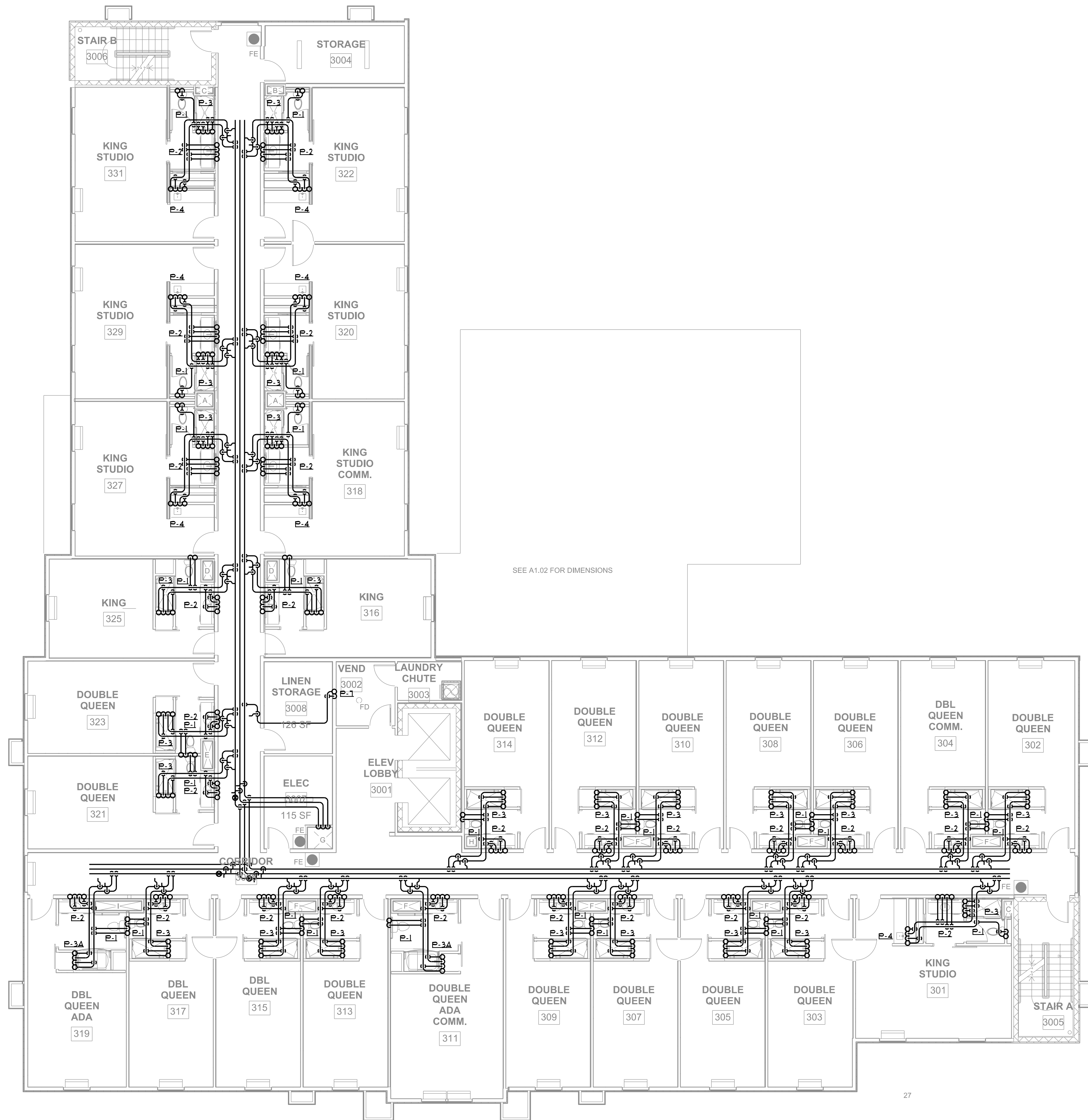
THIRD FLOOR DOMESTIC PLUMBING PLAN