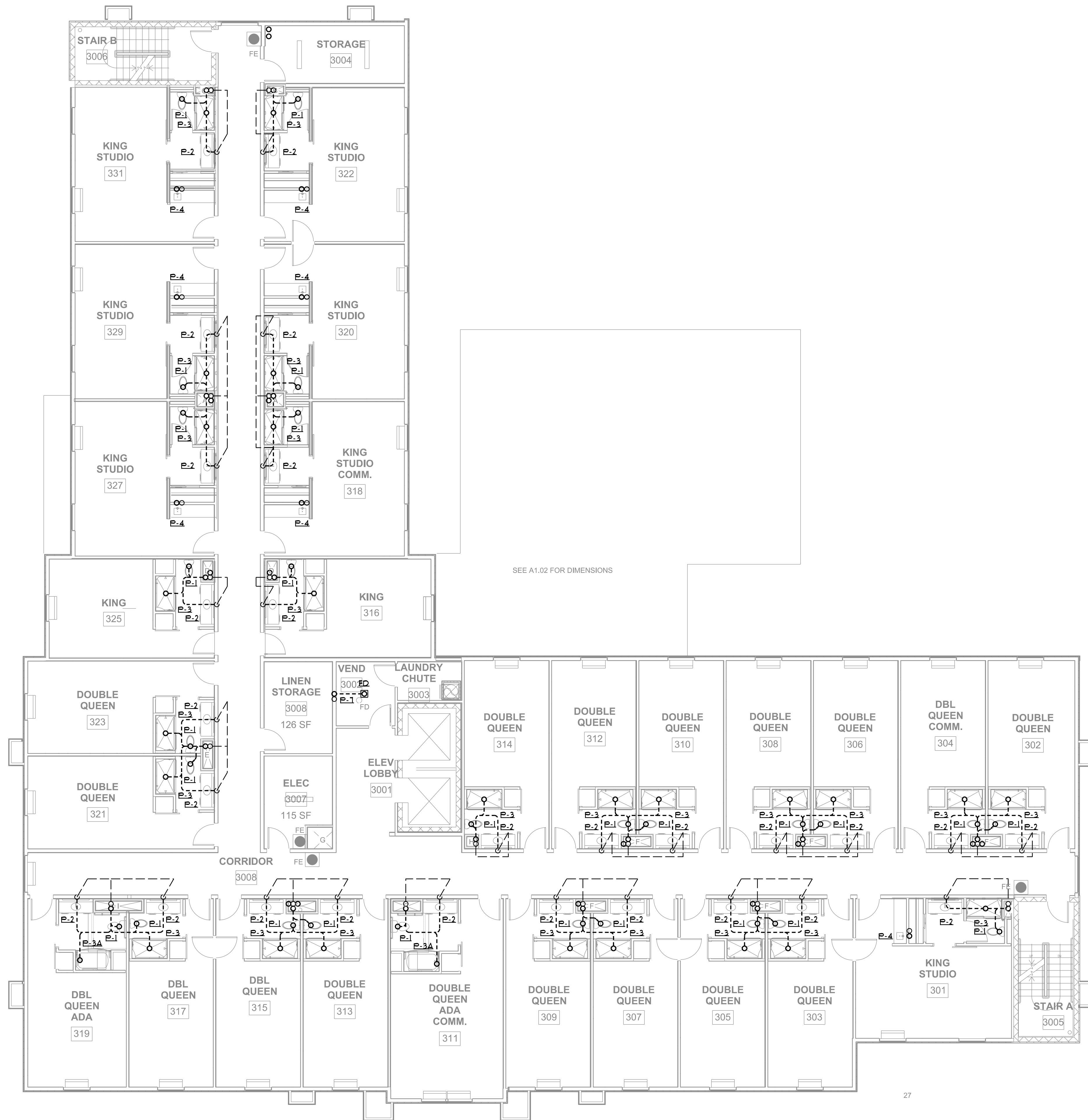
THIRD FLOOR SANITARY PLUMBING PLAN