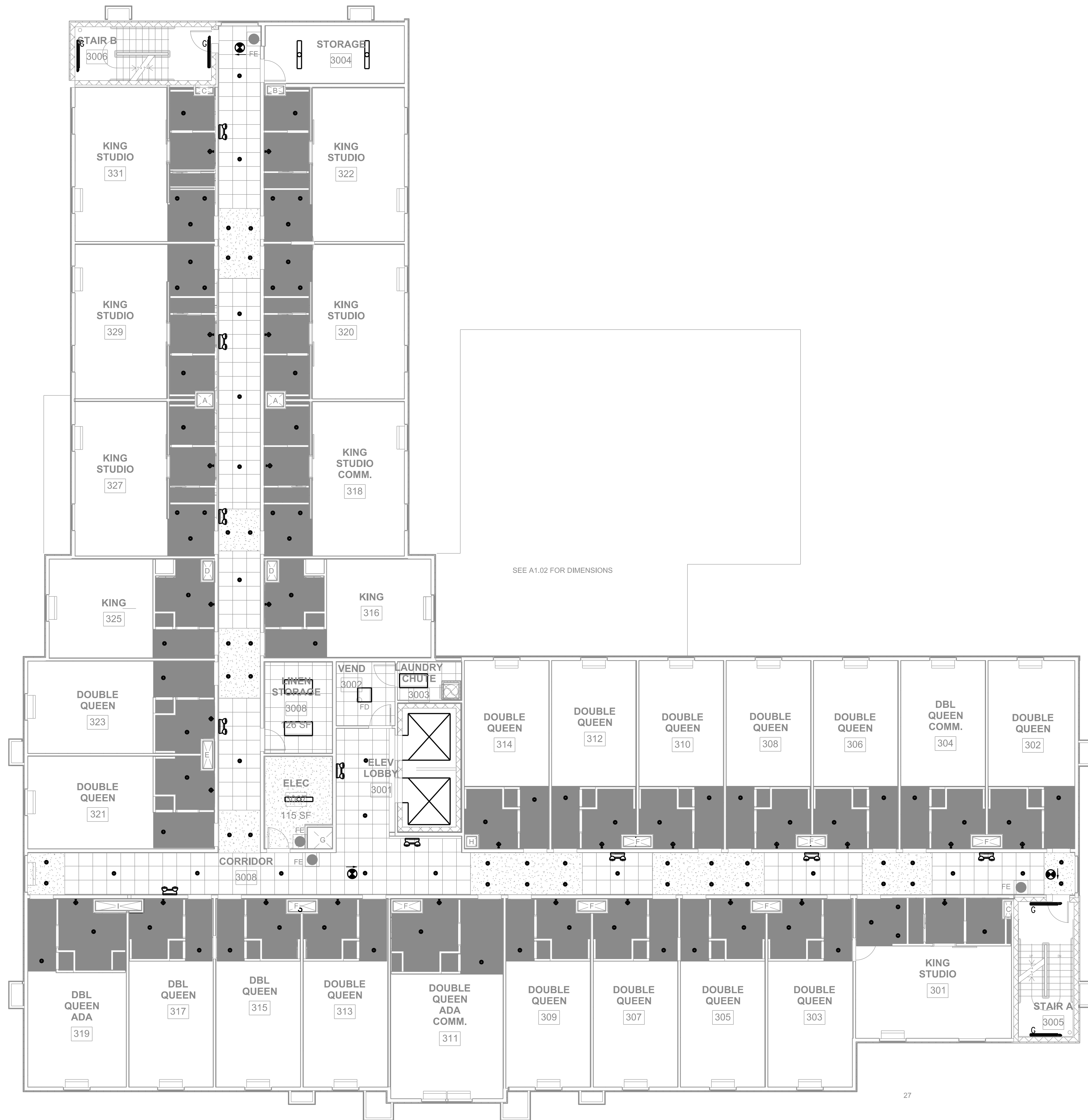
THIRD FLOOR LIGHTING PLAN SCALE - 1/8"=1'-0"