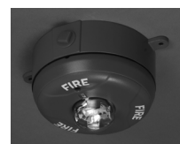
Outdoor Ceiling Strobe