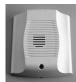
Indoor Wall Horn