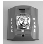
Indoor Wall Horn/Strobe