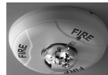
Indoor Ceiling Strobe