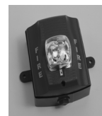
Outdoor Wall Strobe