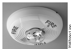
Indoor Ceiling Horn/Strobe