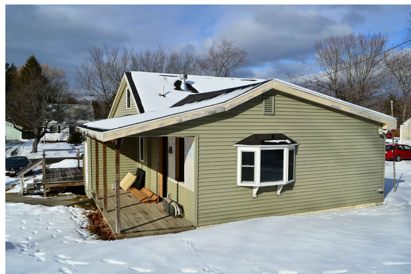
2 EXISTING CONDITIONS SCALE: N.T.S.