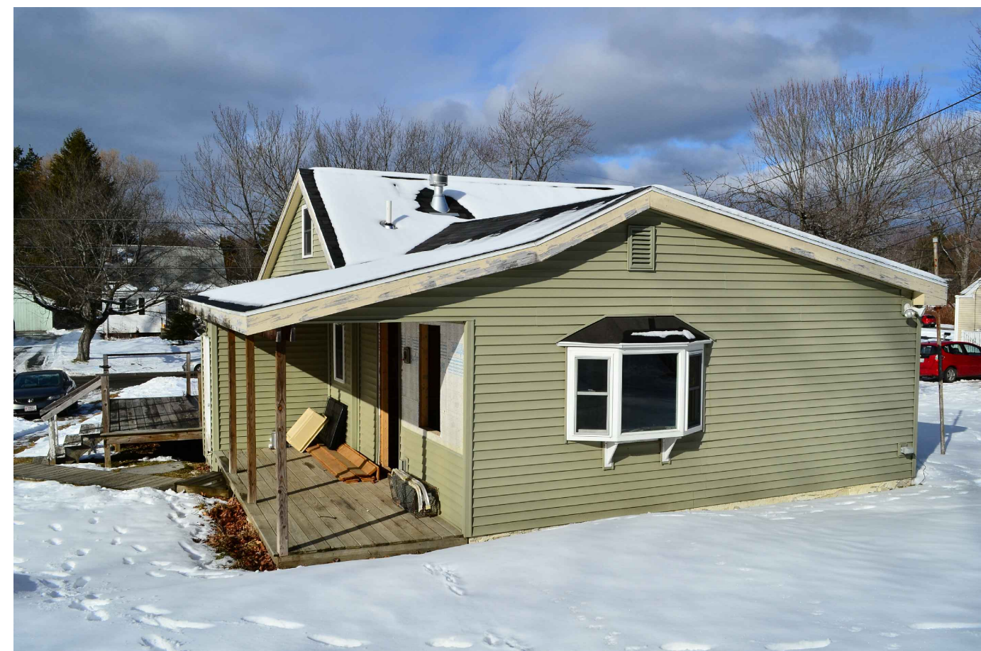
2 EXISTING CONDITIONS SCALE: N.T.S.