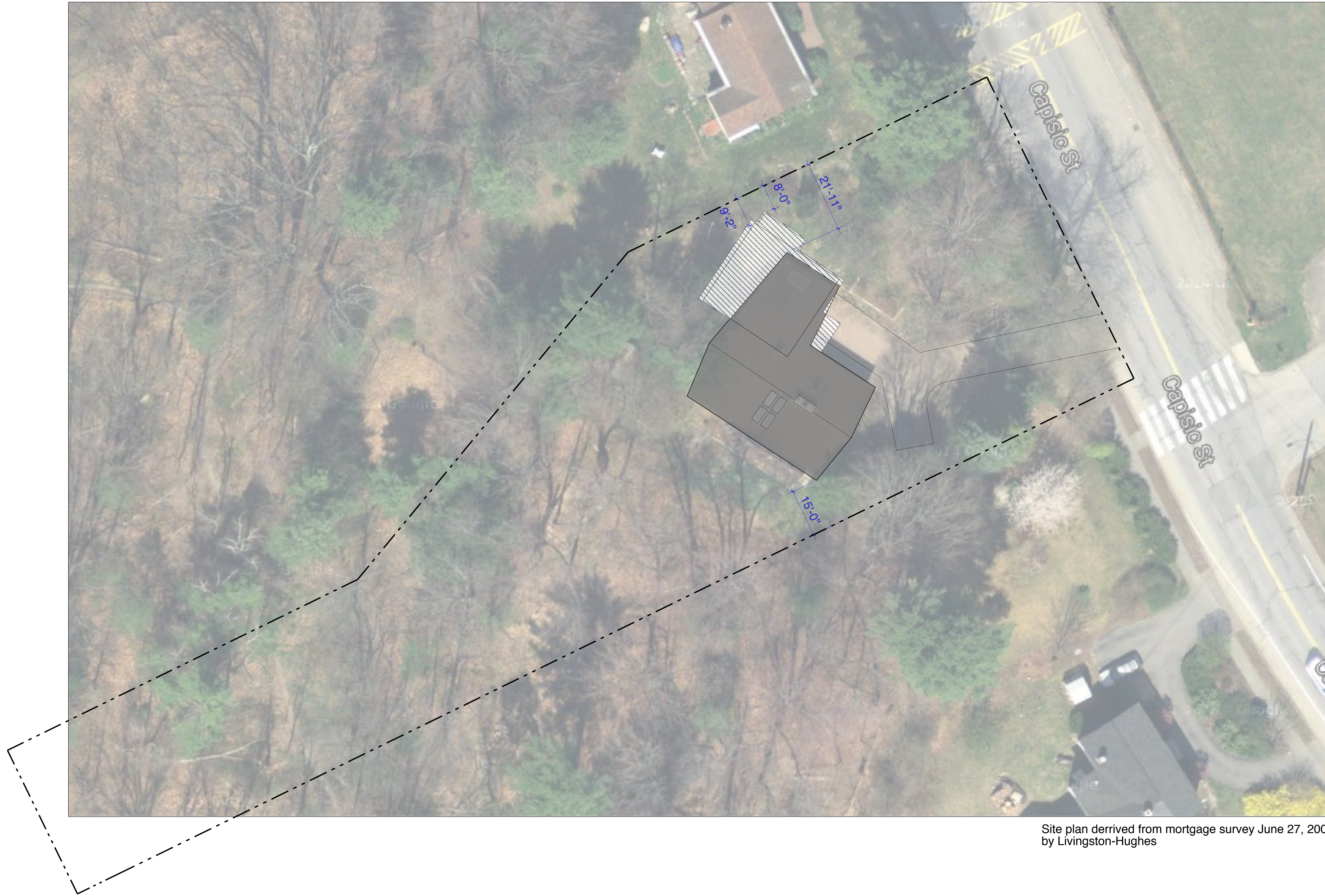
Site plan derived from mortgage survey June 27, 2008 by Livingston-Hughes